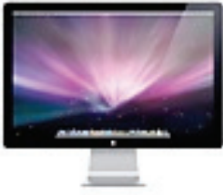
Model MB382 (24-inch)