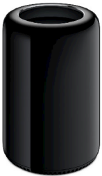
Models MD878, MQGG2 Date introduced October 22, 2013