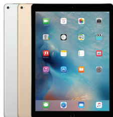
Date introduced September 9, 2015