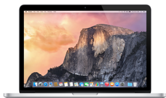
Model MF839 Date introduced March 9, 2015