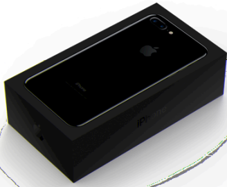
U.S. retail packaging of iPhone 7 Plus contains 86 percent less plastic than the previous-generation iPhone packaging and contains 60 percent recycled content.