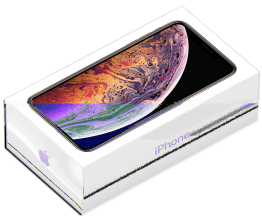
U.S. retail packaging of iPhone Xs Max contains 55 percent recycled content.