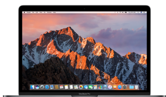
Models MLH32, MLH42, MLW72, MLW82 Date introduced October 27, 2016