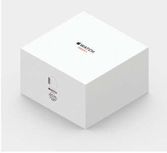
Apple Watch Series 3 (GPS + Cellular) retail packaging contains at least 39 percent recycled content.

The retail packaging for Apple Watch Series 3 (GPS + Cellular) is highly recyclable, and 100 percent of the fiber in its retail box is from either recycled content, bamboo, waste sugarcane, or responsibly managed forests. The following table details the complete set of materials used in the Apple Watch Series 3 (GPS + Cellular) packaging. 1