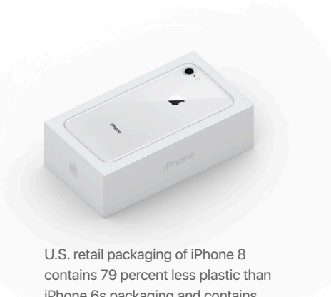
U.S. retail packaging of iPhone 8 contains 79 percent less plastic than iPhone 6s packaging and contains 59 percent recycled content.