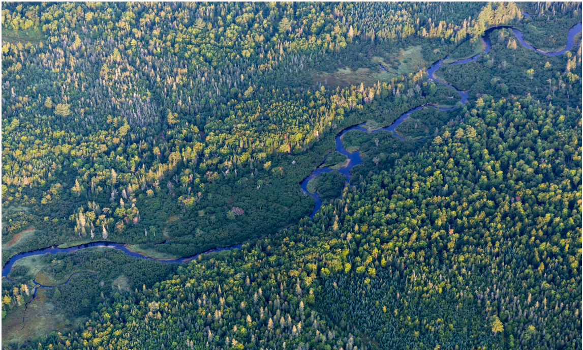
Apple and The Conservation Fund are protecting Reed Forest in Maine.

Through its Working Forest Fund, the Fund aims to ensure the vital role of forests in providing clean air and water, wildlife habitat, and economic benefits for communities across the United States. With support from Apple, the Fund identifies and purchases working forests with ecological and economic assets that were threatened by large-scale fragmentation or development. The Fund then places a conservation easement on the land to ensure that it is sustainably managed and protected from development in perpetuity. Once appropriate partners are found, the Fund transfers the easement to a qualified holder responsible for its enforcement, and sells the forest in the open market. After the sale of the property, they reinvest funds from the sale to protect additional working forests, boosting local economies by maintaining jobs and creating a supply of responsibly managed forest products. 14