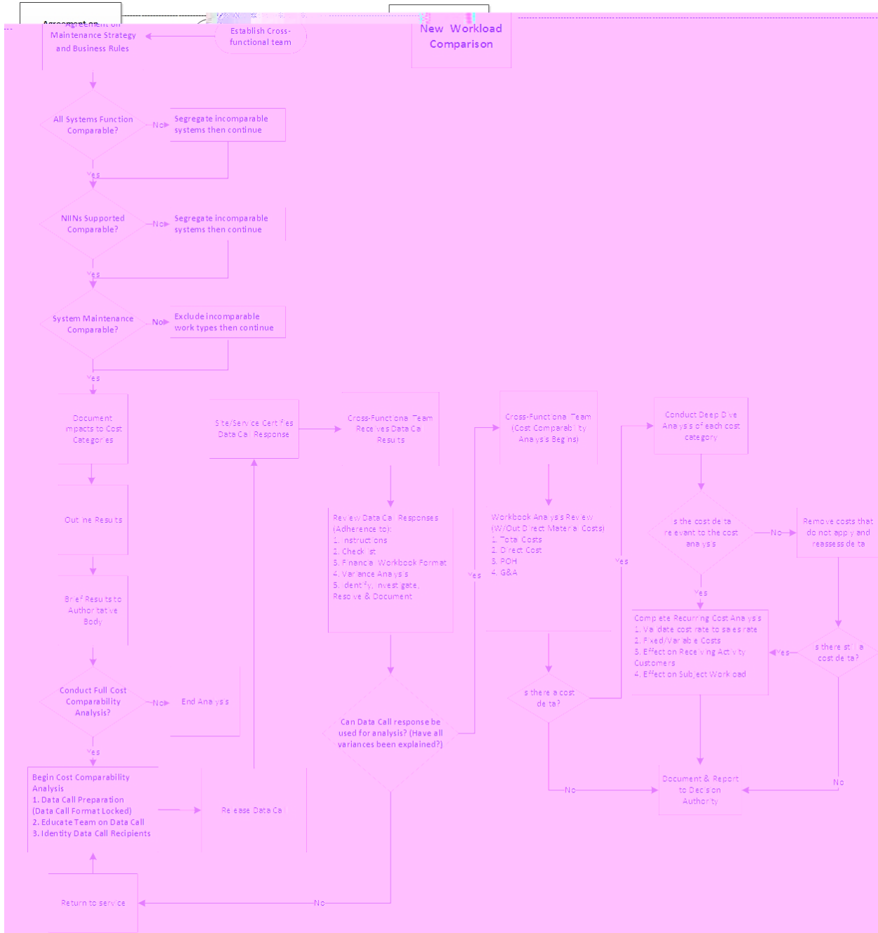
Figure 1. New Workload Comparison

c. System Function Comparability Analysis (Decision Point). The system function comparability analysis outlines the system’s description and functionality to determine what the system is meant to do and how it currently functions. If systems are comparable, proceed to NIIN isolation. If systems are not comparable, remove them from the analysis or replace with a new system and proceed to NIIN Isolation.