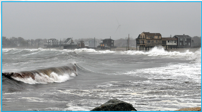
Scituate, Mass., Oct. 29, 2012 - The few summer homes left standing after the Perfect Storm in 1991, stand ready for the tidal surge that is still hours away.