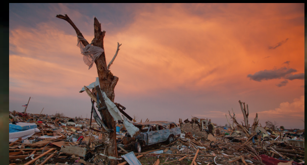
After a tornado, watch out for dangerous debris such as sharp metal, glass or downed power lines.

For more information, visit weather.gov/safety/tornado