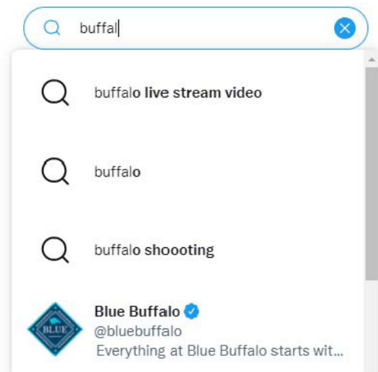
Figure 1: Partial screenshot of Twitter search bar, captured June 22, 2022 (mobile version)

However, other platforms performed even worse. For example, weeks after the attack, Twitter was “auto-suggesting” to users a search for “buffalo live stream video” after a user entered only the partial query “buffal” [sic], both on a desktop browser and on its mobile app: 119