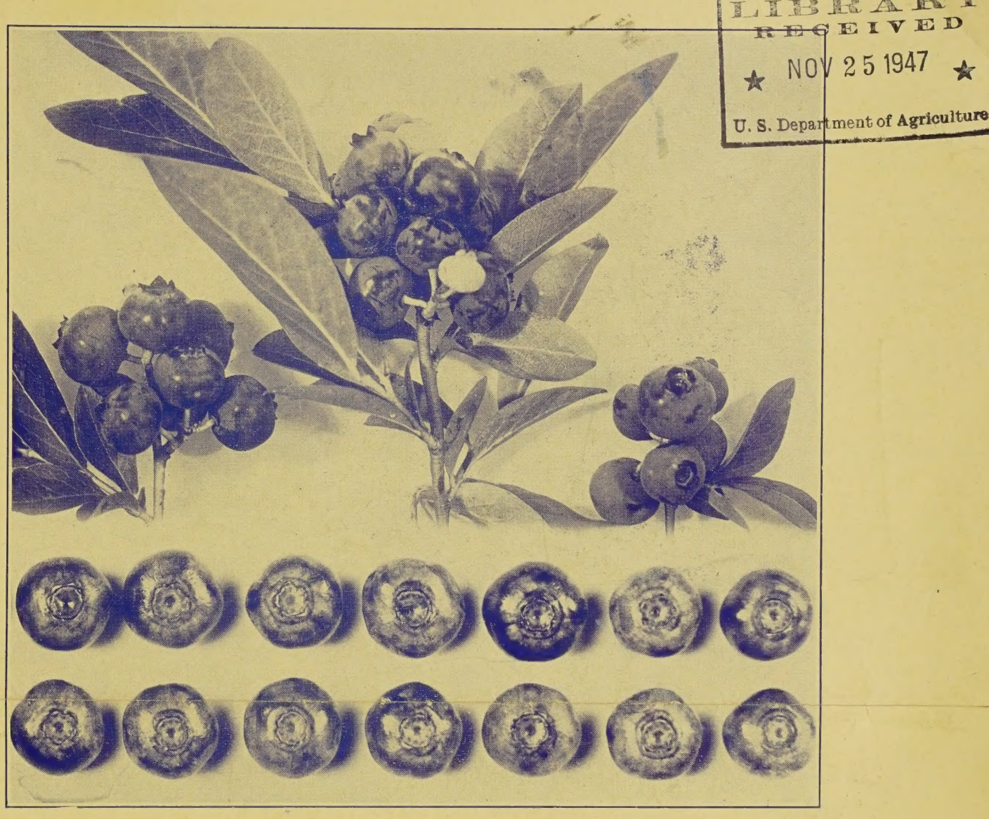
Cultivated Blueberries - Actual Size