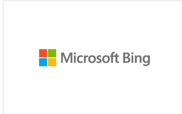
Horizontal logo – Preferred versus stacked logo

Use in full color in all instances unless there is a production limitation.