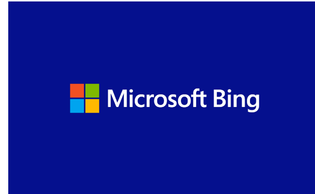
Horizontal logo – On dark backgrounds, including dark areas in photographs, use the version with logotype in white