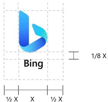
Minimum clear space with name