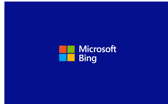
Stacked logo – On dark backgrounds, including dark areas in photographs, use the version with logotype in white