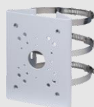
PFA150 Pole Mount