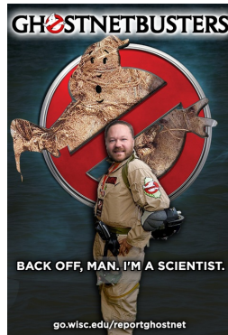
Ghost(net)busters by Wisconsin Sea Grant