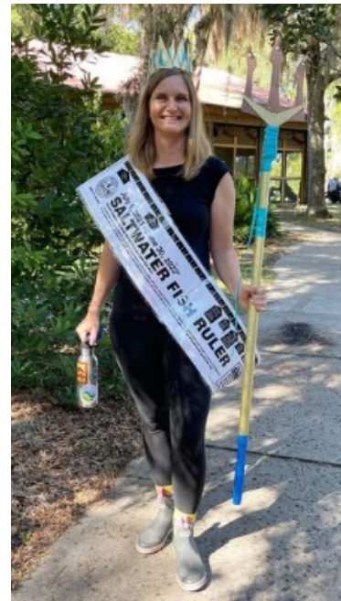
Monarch of the Sea/Fish Ruler by Instagram user abisaurus_lrex