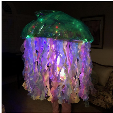
Julie Jellyfish