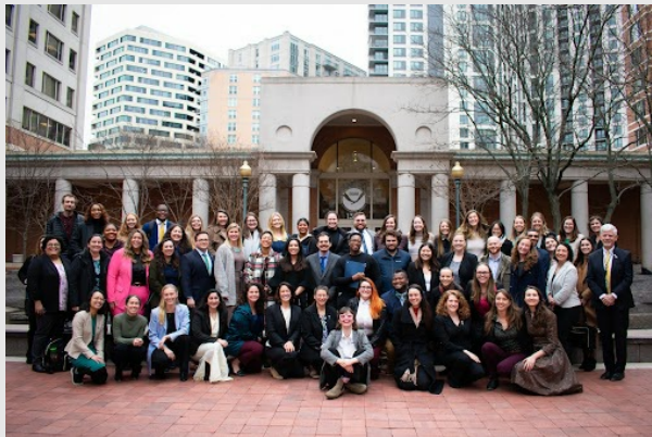
2023 Knauss Fellows at Graduation

In recent weeks, Sea Grant congratulated the 2023 Knauss Fellows during their graduation ceremony from the fellowship and welcomed the 2024 Knauss Fellows with a four-day-long orientation. Check out photos from the D.C.-based festivities!