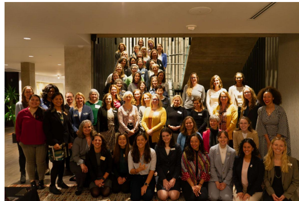
Women of Sea Grant pictured at this month's Sea Grant Association Meeting in Washington, D.C.

March marks Women's History Month. Celebrate with Sea Grant by connecting with organizations that support women in science and by learning about some of the remarkable women in marine and coastal sciences!