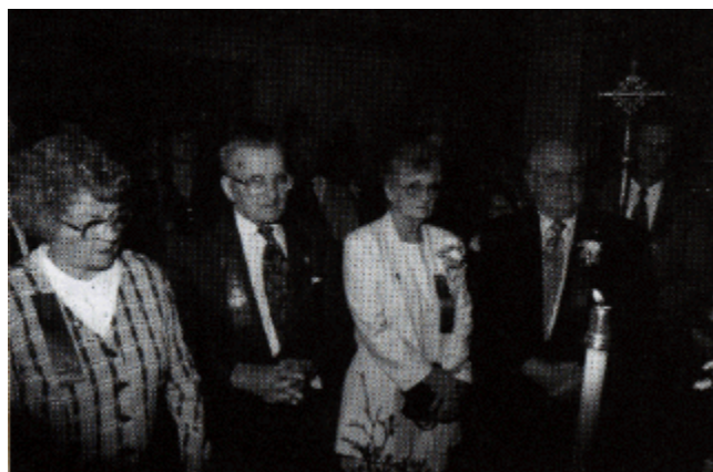
parishioners of St. Onuphrius.

In June 1996, we offered the public a preview of the First Peoples Hall — an extensive series of galleries telling the stories of Canada's Native peoples, as well as those of other First Nations. We have also completed several new modules in the Canada Hall — including the reconstruction and reconsecration of a complete Ukrainian church, including its original interior, 4,000 kilometers from its former home in Smoky Lake, Alberta. We have forged ahead on creating a permanent exhibition space for the Canadian Postal Museum. We have begun an extensive expansion of Adventure World — the Canadian Children's Museum's outdoor park, which features uniquely Canadian forms of transportation, including a bush plane and a lumber tugboat among its interactive displays.