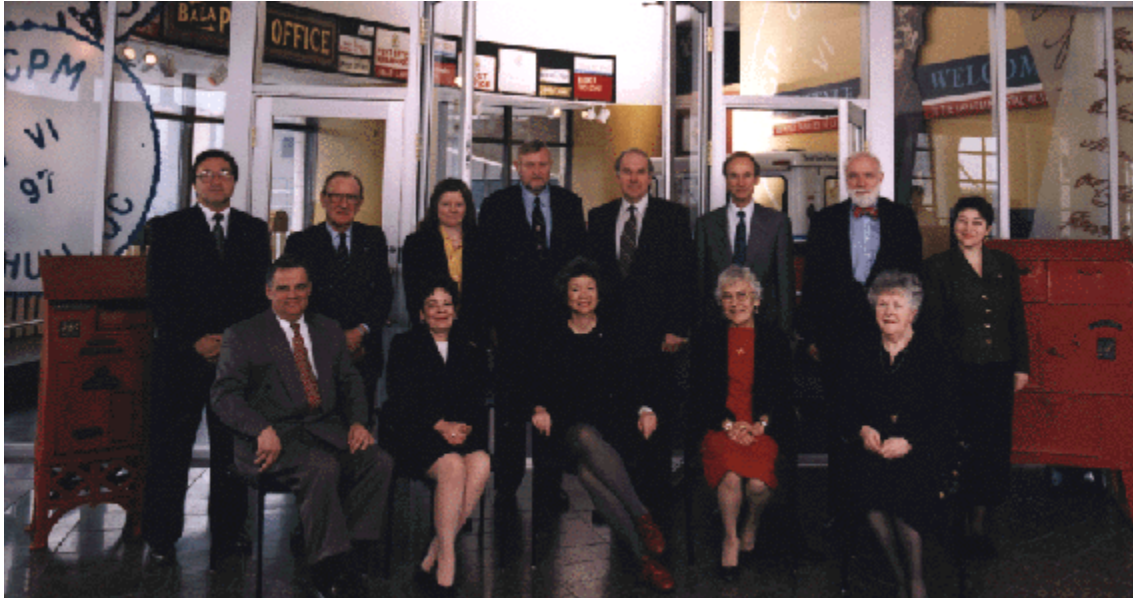
Officers of the Corporation in front of the Canadian Postal Museum

The Canadian Museum of Civilization Corporation is a Crown Corporation established pursuant to the Museums Act (Statutes of Canada 1990, Chapter 3) , which came into force on July 1, 1990. Under the Museums Act , the Corporation has a specific mandate "to increase, throughout Canada and internationally, interest in, knowledge and critical understanding of and appreciation and respect for human cultural achievements and human behaviour by establishing, maintaining and developing for research and posterity a collection of objects of historical or cultural interest, with special but not exclusive reference to Canada, and by demonstrating those achievements and behaviour, the knowledge derived from them and the understanding they represent."