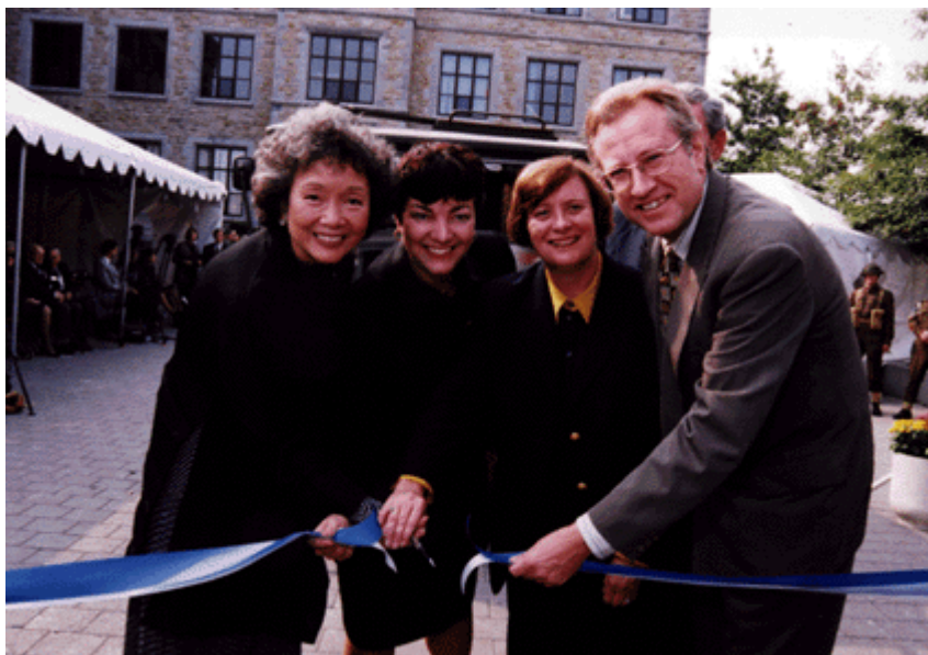
General Motors of Canada gives $1 million to the Passing the Torch campaign

The War Museum, like the Canadian Museum of Civilization, has benefited considerably from strategic partnerships. Renewed interest in our military heritage over the past few years and a higher public profile for the institution have made it easier to attract corporate sponsorship. This past year we have enjoyed the generous support of General Motors Canada ; the Molson Foundation; the MacDonald Stewart Foundation; and many other foundations and corporations.