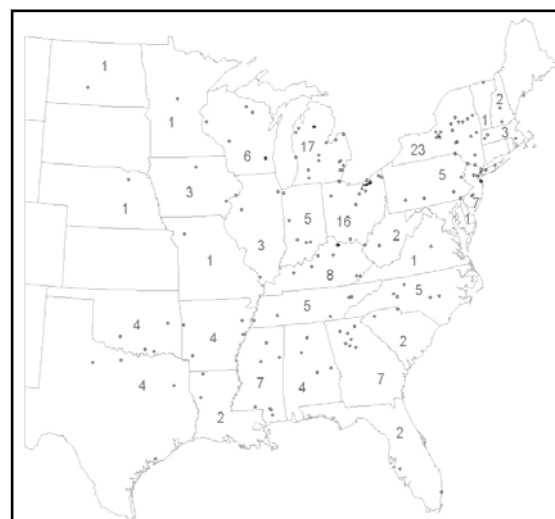
Figure 1. U.S. derecho fatalities by state 1986-2003. Circles indicate fatality locations.