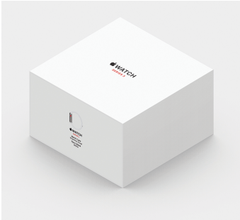
Apple Watch Series 3 (GPS + Cellular) retail packaging contains at least 39 percent recycled content.

The retail packaging for Apple Watch Series 3 (GPS + Cellular) is highly recyclable, and 100 percent of the fiber in its retail box is from either recycled content, bamboo, waste sugarcane, or responsibly managed forests. The following table details the complete set of materials used in the Apple Watch Series 3 (GPS + Cellular) packaging. 1