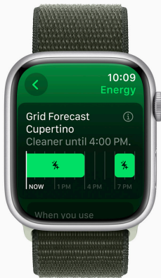
Grid Forecast in the Home app shows customers when cleaner electricity is available from the grid, empowering them with information to help reduce greenhouse gas emissions.

In addition to designing our products to be more efficient and investing in renewables, we're empowering our customers to address emissions from the electricity used to power or charge Apple devices by helping enable their flexibility, contributing to grid decarbonization more broadly. At the same time, Apple devices represent a tiny fraction of the average household's overall carbon footprint. Eliminating the carbon impact of Apple devices on behalf of our customers by matching it with renewable energy is an entry point to helping our customers meaningfully reduce their household emissions. Many consumers care about their environmental impact, 15 and we're committed to empowering our customers to participate in carbon reduction with us — in addition to, but not as a substitute for, Apple's efforts. As we support our customers to address their home energy emissions, we keep working toward our own ambitious goal to be carbon neutral across our entire carbon footprint by 2030. 16