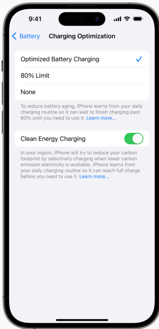
Clean Energy Charging optimizes for when the grid is using cleaner energy sources with lower emissions.