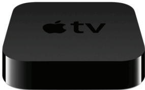
Models MD199 Date introduced March 7, 2012