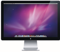
Model MC007 (27-inch)