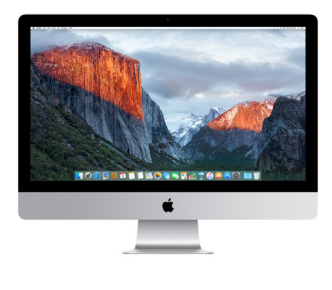
Models MK462, MK472, MK482 Introduced October 13, 2015