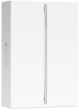
Retail packaging for iPad mini 4 uses a minimum of 38 percent post-consumer recycled content.