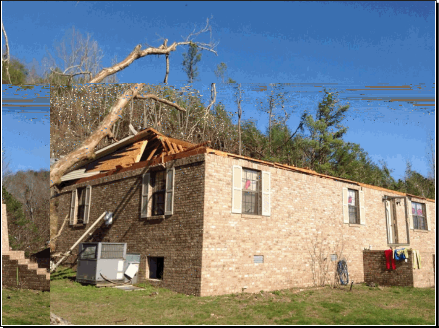
EF-2 damage. Roof of small house was removed/destroyed with walls still standing. Estimated winds ~115 mph

Location Date/Time Deaths & Injuries Property & Crop Dmg Event Type and Details