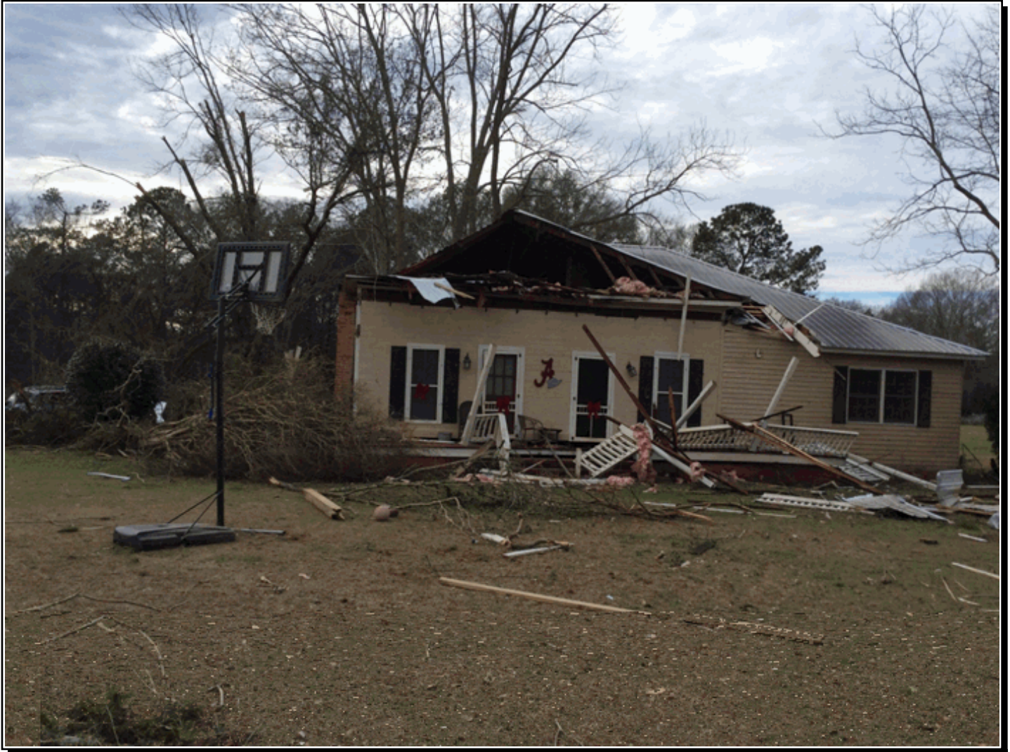
An EF2 intensity tornado produced extensive damage to this home on Gin Creek Road, just east of Luverne, AL.

Location Date/Time Deaths & Injuries Property & Crop Dmg Event Type and Details Alabama.