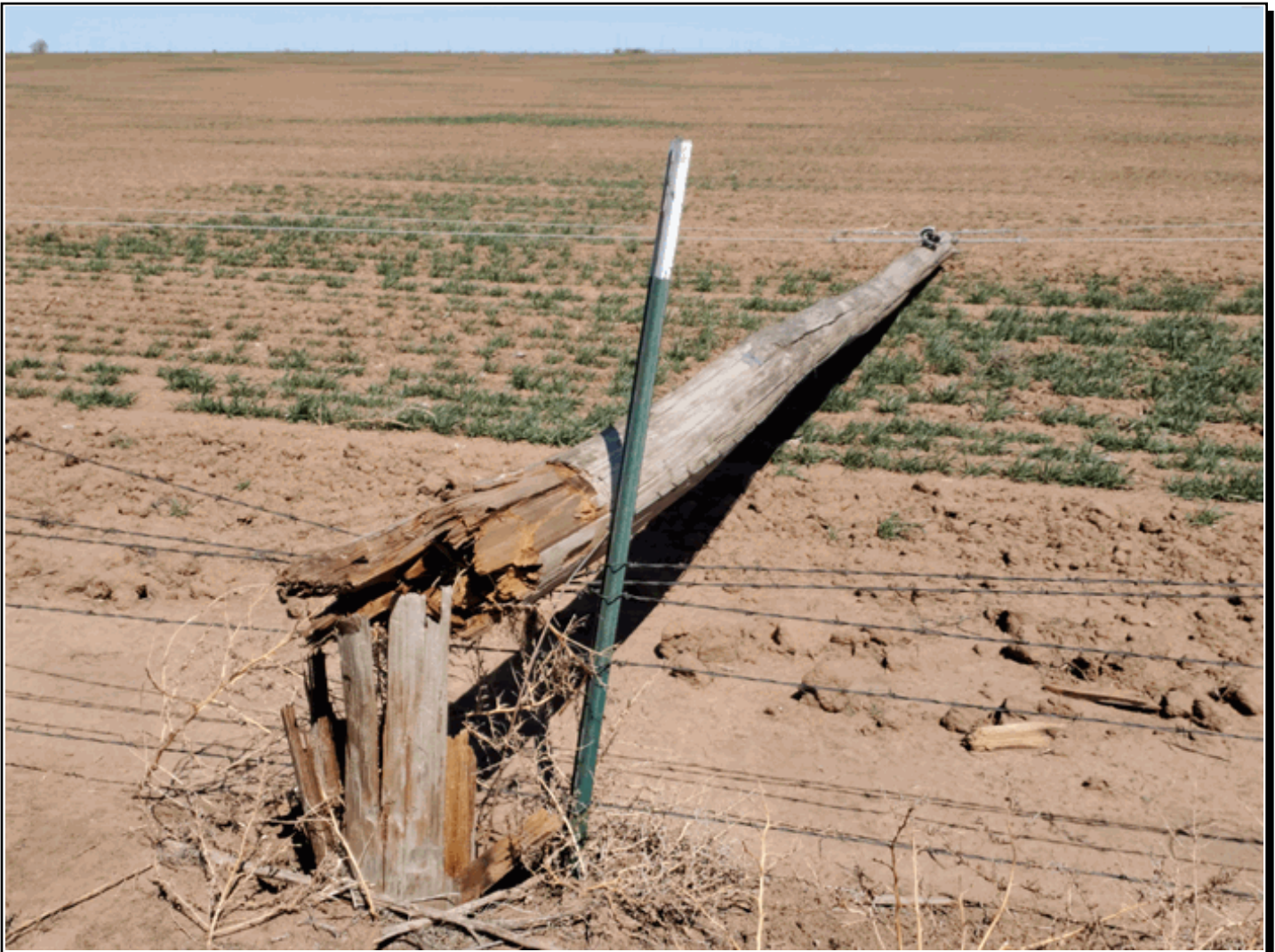
Photograph of a snapped off power pole west of Happy near the intersection of County Road C and County Road 3.

An intense upper level low slowly moving east near the four corners region Saturday afternoon resulted in an outbreak of tornadic thunderstorms across the Panhandle and South Plains of West Texas. An upper level jet streak rotating around the upper low enhanced large scale lift across the region by the afternoon hours. Surface cyclogenesis in the Texas Panhandle drew the surface warm sector northward. Initial thunderstorm development occurred along a dryline located roughly along the US Highway 385 corridor. Storms quickly became severe as they moved into a very unstable airmass characterized by mixed layer CAPEs of 1500-2000 J/kg. Very strong effective layer shear and low level helicities were conducive to produce tornadic supercells. A NWS storm survey reviewed three tornado paths from the 13th. The largest and longest duration tornado developed to the west-southwest of the town of Happy (Swisher County) and had a maximum damage rating of EF-1. This tornado extended well into the Texas Panhandle where it caused EF-2 damaged as determined by a survey by the NWS Weather Forecast Office in Amarillo. Another tornado north of Hart passed near a Texas Tech University West Texas mesonet recording a wind gust to 87 mph. A total of eight tornadoes were observed this day with three given EF ratings. The remaining five tornadoes were given ratings of EF-Unknown due to no survey being conducted and no reports of damage.