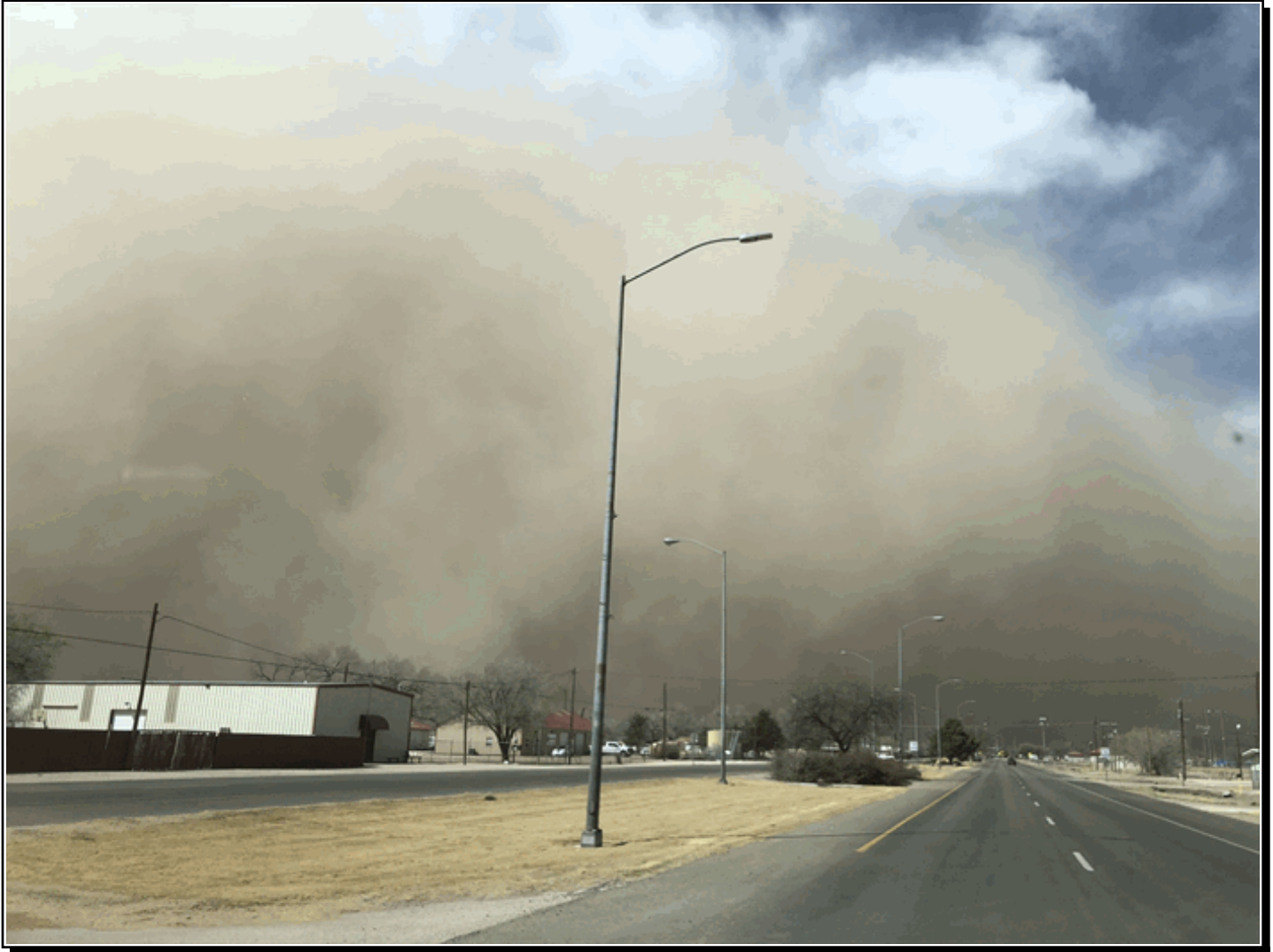
A wall of dust (haboob) rolling through Hobbs, New Mexico on the afternoon of the 22nd.

Location Date/Time Deaths & Injuries Property & Crop Dmg Event Type and Details