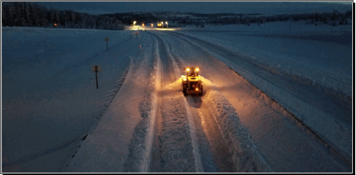
Tractors and heavy equipment continue to plow the Interstate 80 Summit around the clock to clear the 5+ foot drifts along the roadway.

Historic winter storm crippled much of southeast Wyoming with heavy wet snow followed by strong winds and blizzard conditions. Cheyenne received 22.7 inches of snowfall in 24 hours (storm total 30.8 inches) with 4 to 6 foot drifts developing all over. Highest snowfall amount reported over 70 inches (4.5 inches snow water equivalent) in the North Laramie Range. Most areas were digging out from the storm for at least the following week as snow plows got stuck on roadways. Received numerous reports of roof collapses due to the heavy, wet snow. Areas of southeast Wyoming also experienced thundersnow with the heavier snow bands early Sunday morning.