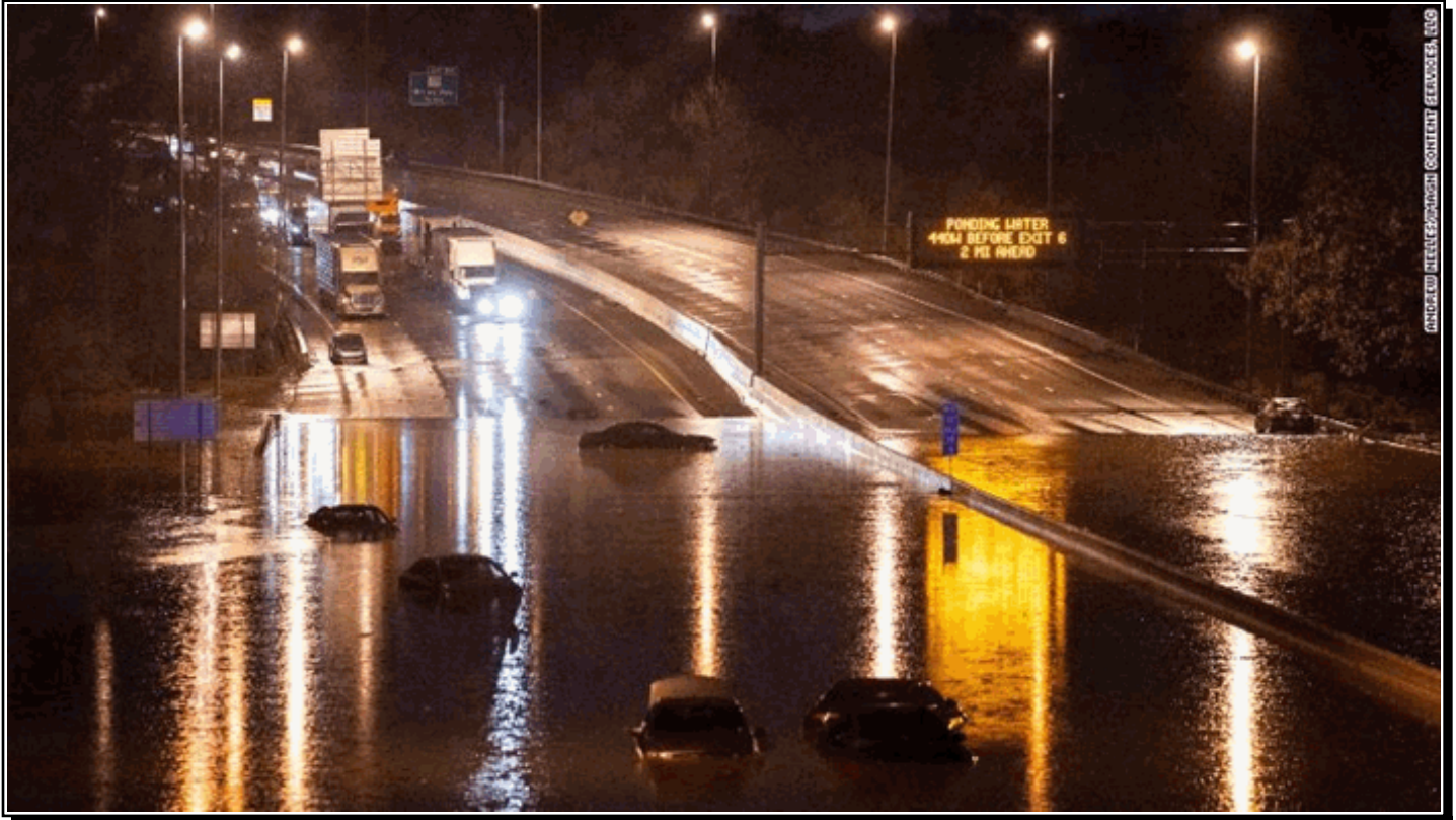
Numerous cars are submerged in flood waters on Interstate 24 at Antioch Pike in Nashville during the historic flooding of March 27-28, 2021.

Location Date/Time Deaths & Injuries Property & Crop Dmg Event Type and Details