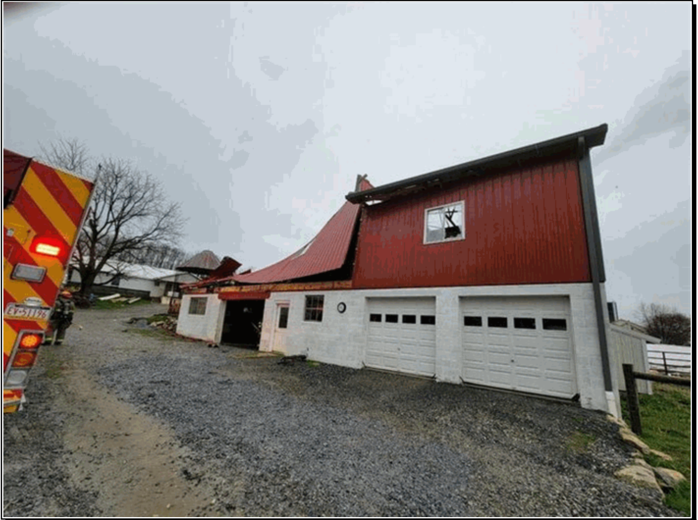
Partial collapse of a barn near Gap, PA.

A sharp cold front crossed the area during the afternoon of March 28, 2021, generating a solid line of gusty showers over western Pennsylvania that very gradually intensified as it progressed eastward across the commonwealth and eventually produced isolated thunder. This line eventually produced some wind damage, knocking down a barn in far eastern Lancaster County near Gap.