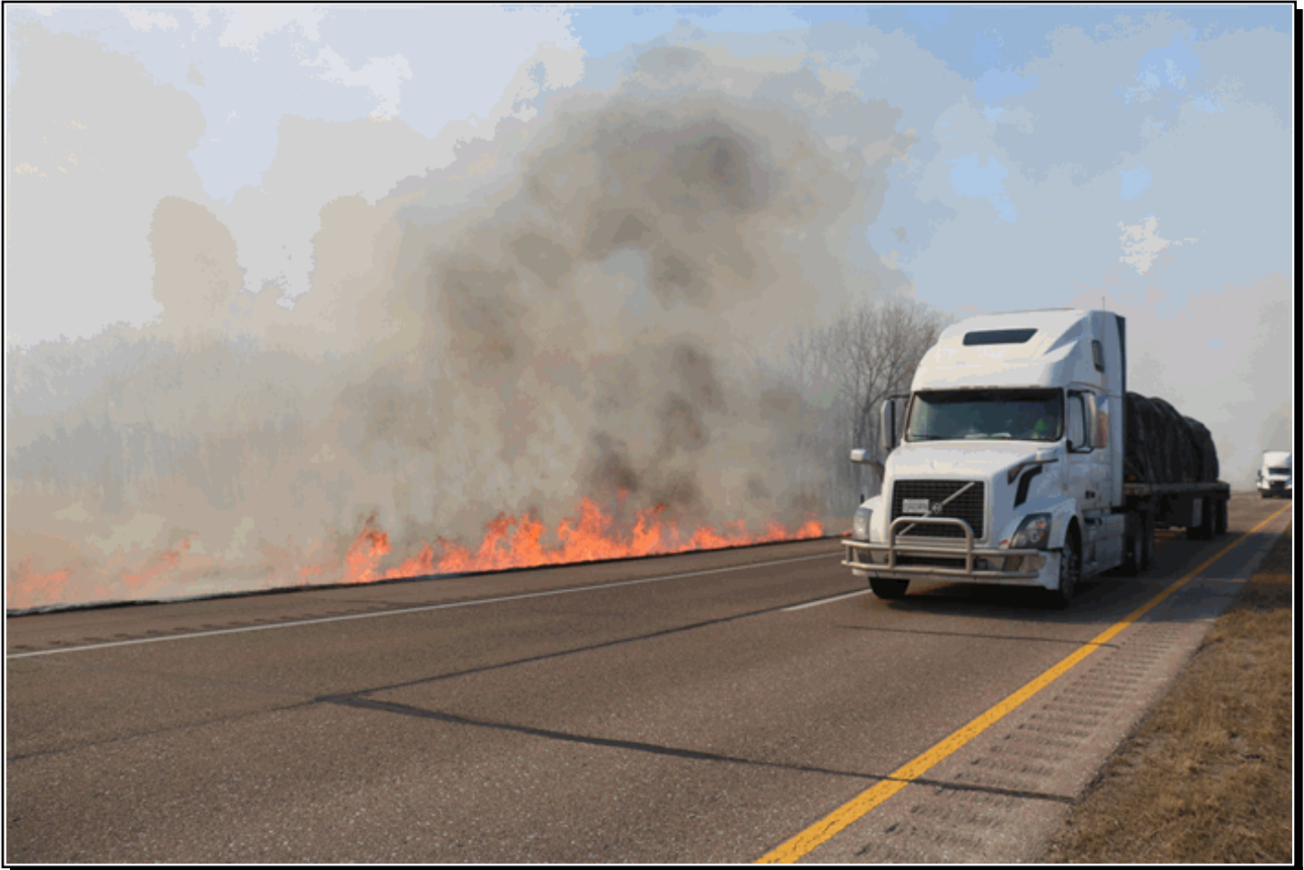
Fire along Interstate 80 in Dawson County on March 4th.

Location Date/Time Deaths & Injuries Property & Crop Dmg Event Type and Details