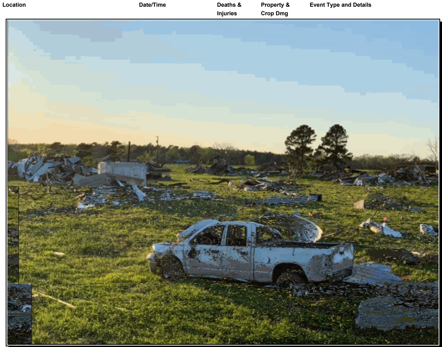
This is all that remains of a mobile home, truck, and metal outbuildings after an EF2 tornado tore through the Antioch community just south of Carthage in South-central Panola County during the evening of March 27th, 2021.