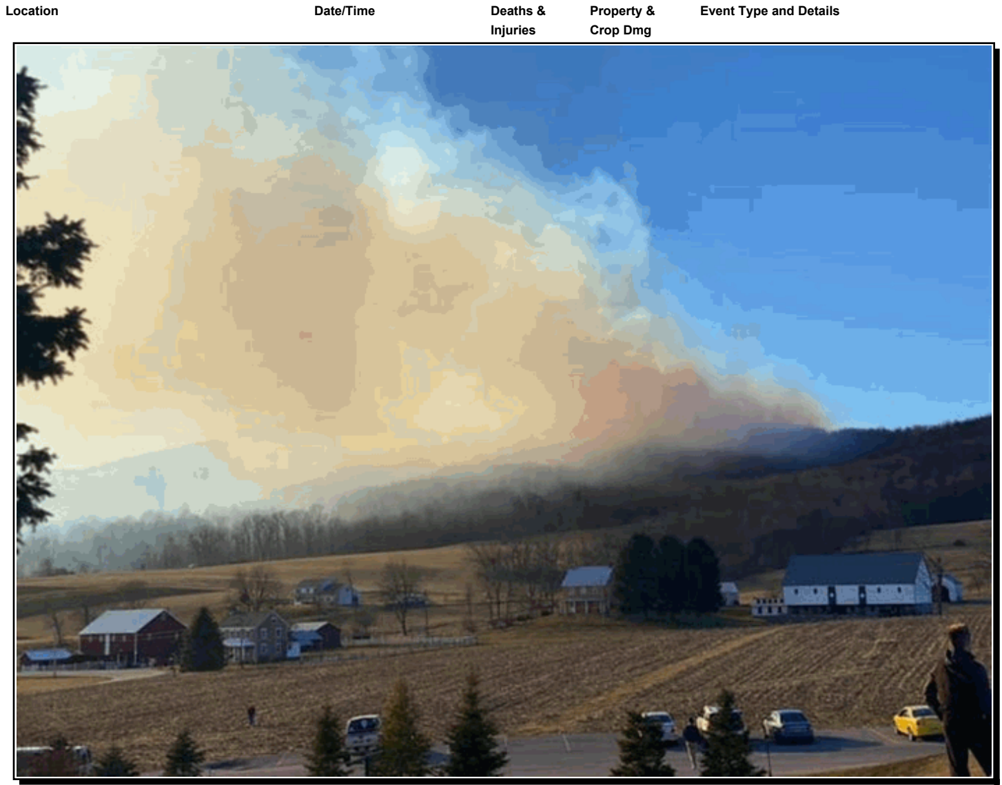
Daytime photo of a forest fire on South Mountain near Dillsburg, PA on March 14.