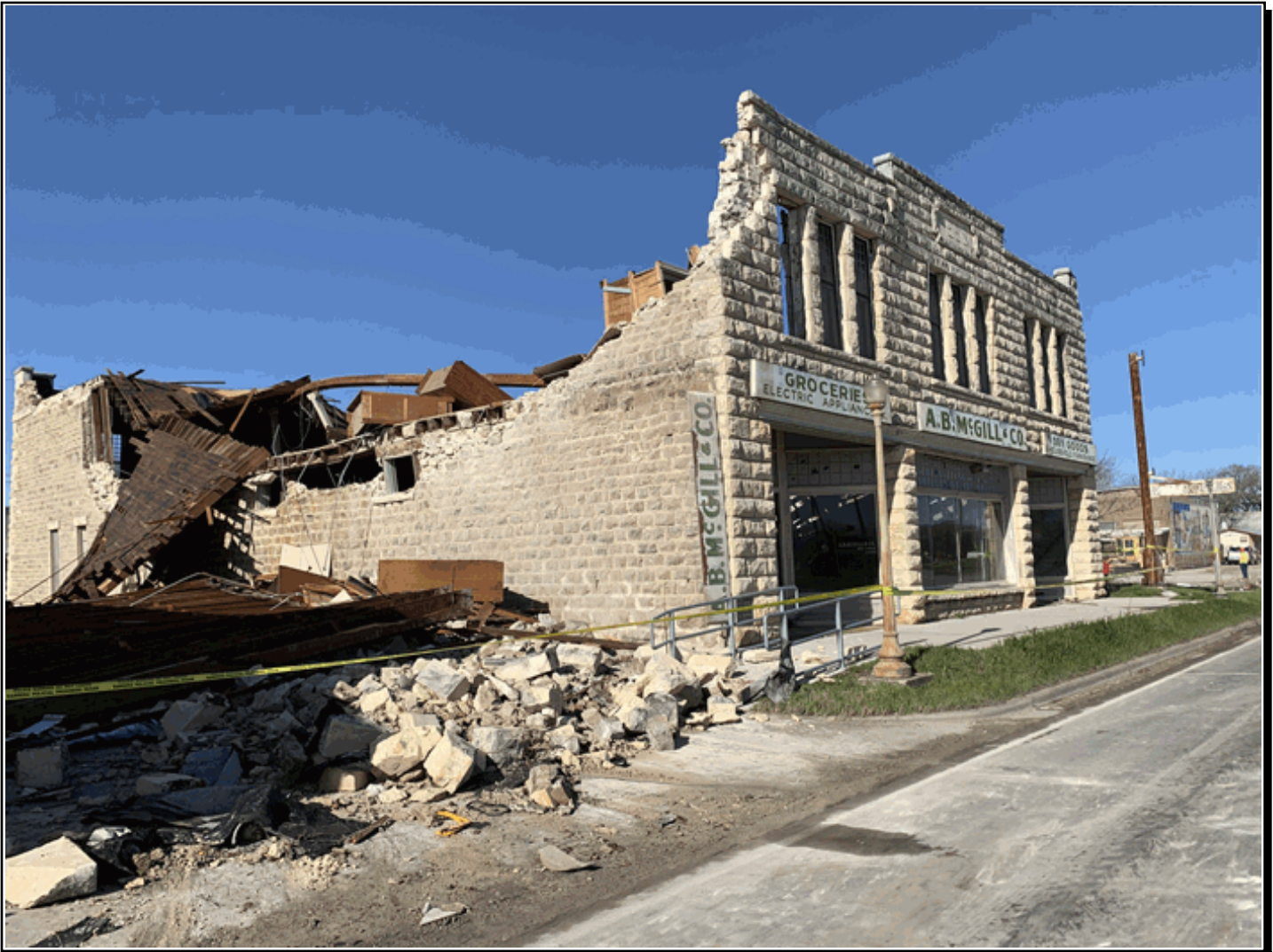
A historic building in Bertram TX on Highway 29 sustained wind damage from an apparent microburst. Walls collapsed and pieces of the roof and flying debris likely caused an adjacent building's roof to also collapse.

An upper level low moved from the Four Corners region to the southern Plains and brought a cold front through South Central Texas. Thunderstorms developed along the front and some of these storms produced large hail and damaging wind gusts.