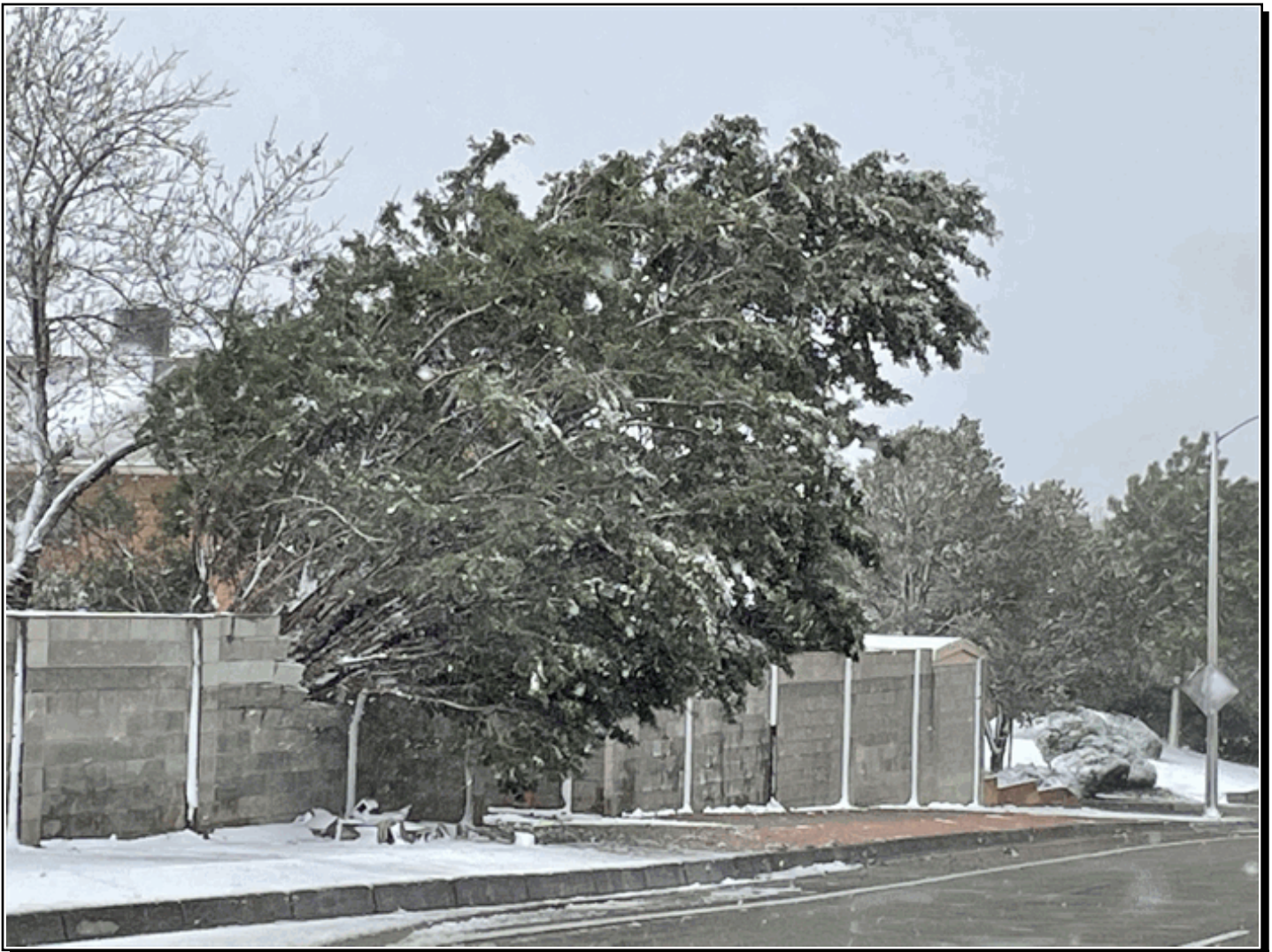
A large tree was downed at Spain and Juan Tabo in northeast Albuquerque during the early morning hours of March 24, 2021.

A strong and cold low pressure system deepened over the Great Basin area before tracking eastward over the state of New Mexico starting on March 23 and continuing through March 24, 2021. Meanwhile, a potent cold front surged south and west through eastern New Mexico, and upslope flow associated with this front helped to set the stage for heavy snow across the east slopes of the central mountain chain. The highest snow accumulations were observed across the northern mountains and along the east slopes where 12 to 24 inches was received. This led to snow-packed and icy roads across much of northern and central New Mexico, and travel was heavily impacted. A major accident involving 39 vehicles along Interstate 40 east of Moriarty led to several injuries as well as the closure of the busy travel corridor. Meanwhile, as the cold front was channeled through the central mountain chain, very strong gap winds were observed in the Albuquerque area. The Albuquerque Sunport measured a peak wind gust of 68 mph which resulted in numerous reports of downed trees and power outages across the city.