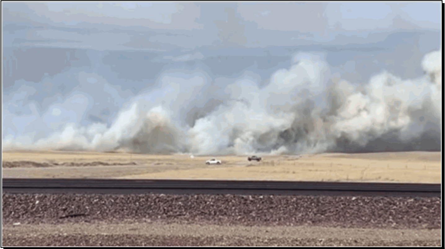
The Greenhouse Fire on Sunday March 28th, 2021.

Location Date/Time Deaths & Injuries Property & Crop Dmg Event Type and Details