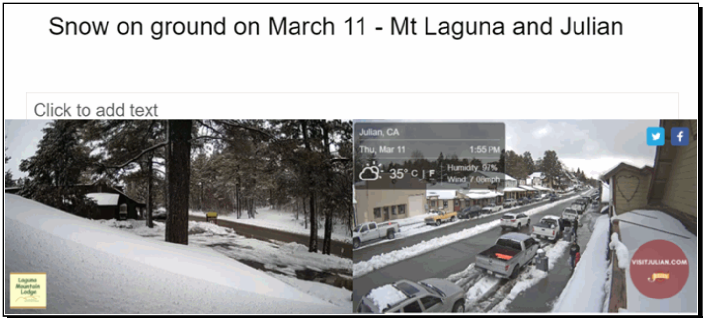
Webcameras showed the snow on the ground in San Diego mountains on March 11.

A West Coast trough of low pressure impacted Southern California March 9th through 13th. This storm brought periods of windy conditions across the mountains and deserts, along with widespread rain and snowfall, and areas of flooding and debris flows being observed as well.