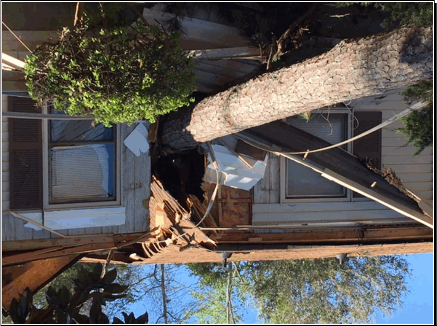
Thunderstorm winds blew down several trees, including this one onto a home, in the town of Wagener in NE Aiken Co SC.

Location Date/Time Deaths & Injuries Property & Crop Dmg Event Type and Details