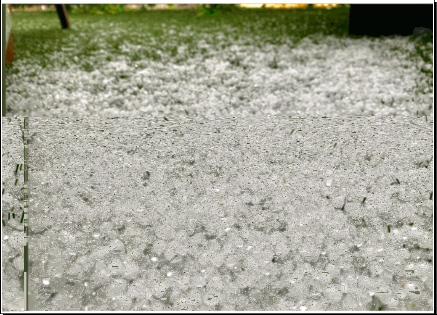
Facebook post at 1 pm March 3 in San Diego.

Location Date/Time Deaths & Injuries Property & Crop Dmg Event Type and Details