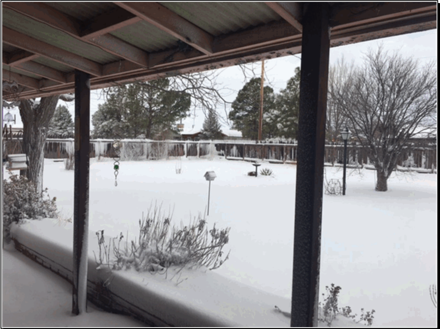
About 4 inches of snow was reported by a trained spotter in Clayton on the morning of March 17, 2021.

Location Date/Time Deaths & Injuries Property & Crop Dmg Event Type and Details