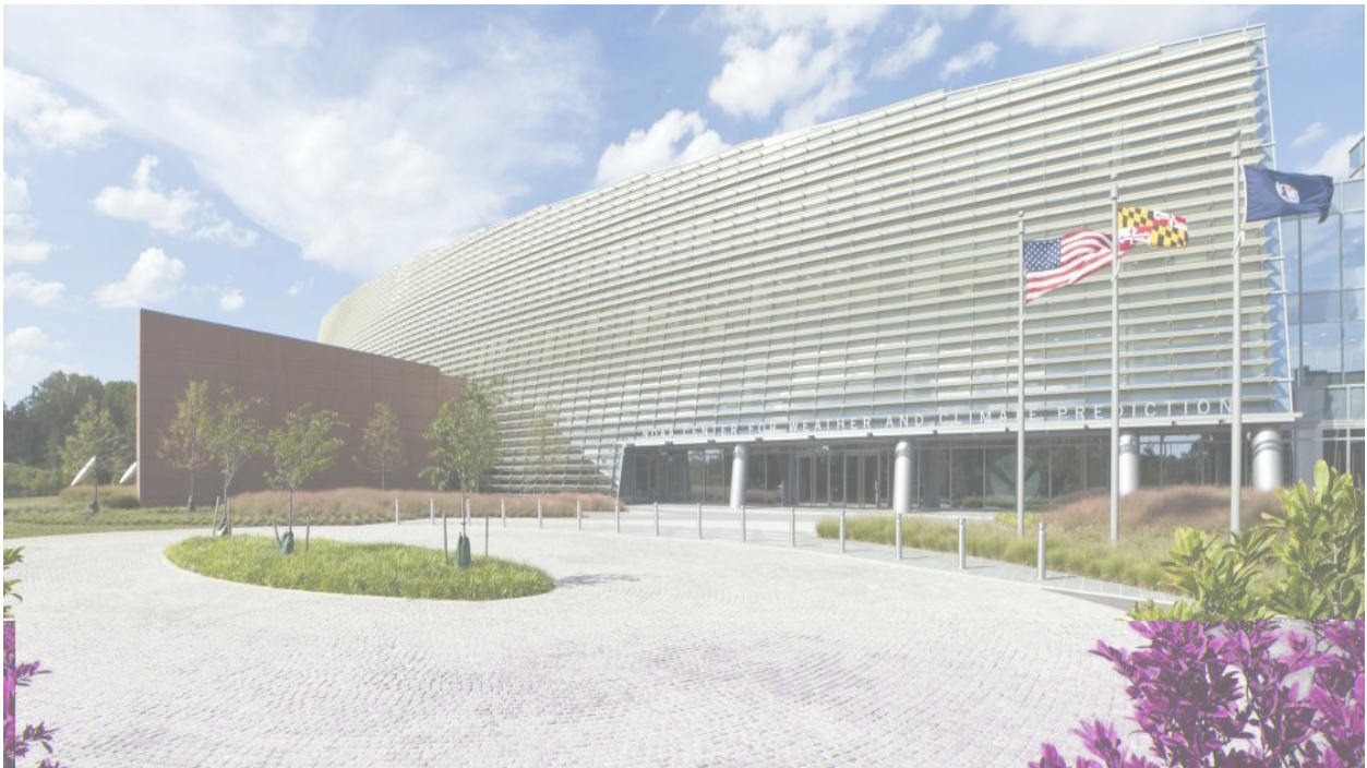
The Weather Prediction Center is located within the NOAA Center for Weather and Climate Prediction in College Park, Maryland