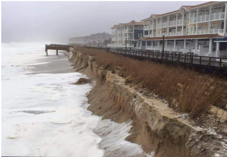
Figure 3: Erosion on Bethany Beach, DE (courtesy of Alex Liggitt, @ABC7Alex).