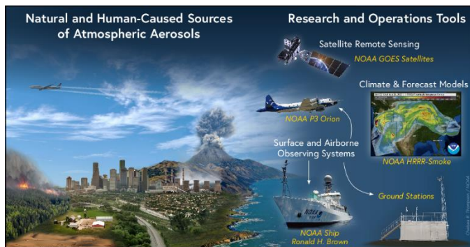
Figure 1. Natural and human-caused sources of atmospheric aerosols are shown on the left. NOAA’s research and operational tools used to address aerosol-weather-climate interactions are shown on the right.

Aerosols have many sources in nature and from human activities (Figure 1). Some aerosols are directly emitted into the atmosphere (e.g., mineral dust, soot, sea salt, and volcanic ash), and others are formed from reactions within the atmosphere. In the lower atmosphere aerosols reside for a few days to a few weeks before being removed by precipitation and other processes, while at high altitudes in the stratosphere they can remain for months or years before being carried to lower altitudes and removed.