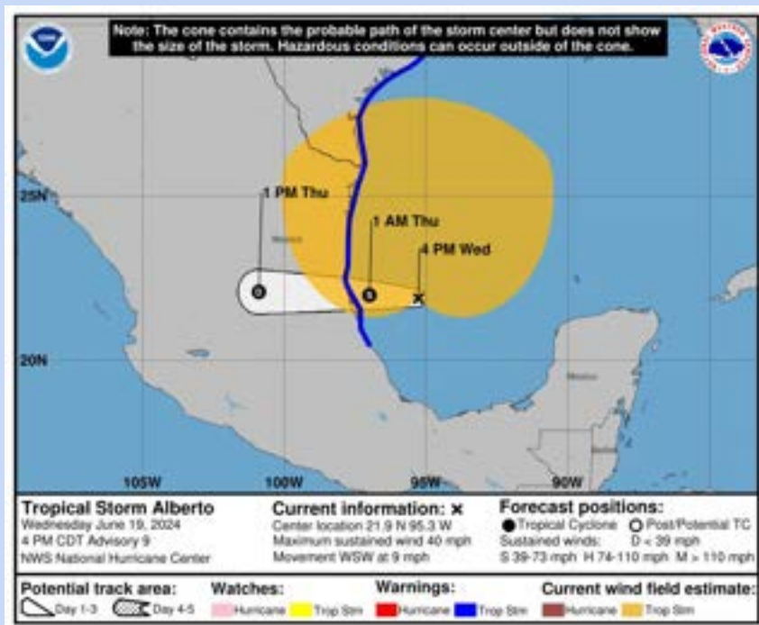
Above: Track of Tropical Storm Alberto

When something like a tropical storm or a hurricane begin to threaten the region, we shift our normal work schedule to a modified operations mode called “Tropical Operations”, and they are 12 hour shifts as opposed to the standard 8 hour shifts that we normally work. This allows for one group to cover the day time hours and another to cover the night time hours. There is also an all-hands shift briefing in which the staff passes on all events that have occurred, anything they have noticed in regards to both the forecast and equipment, and any concerns they have as well. Of course, the Brownsville office is not alone during these “Tropical Operations”.