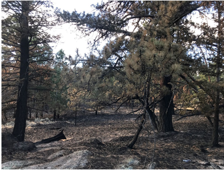
An example of moderate severity burn on the Cameron Peak Fire

www.ksre.ksu.edu/library/hort2/mf632.pdf