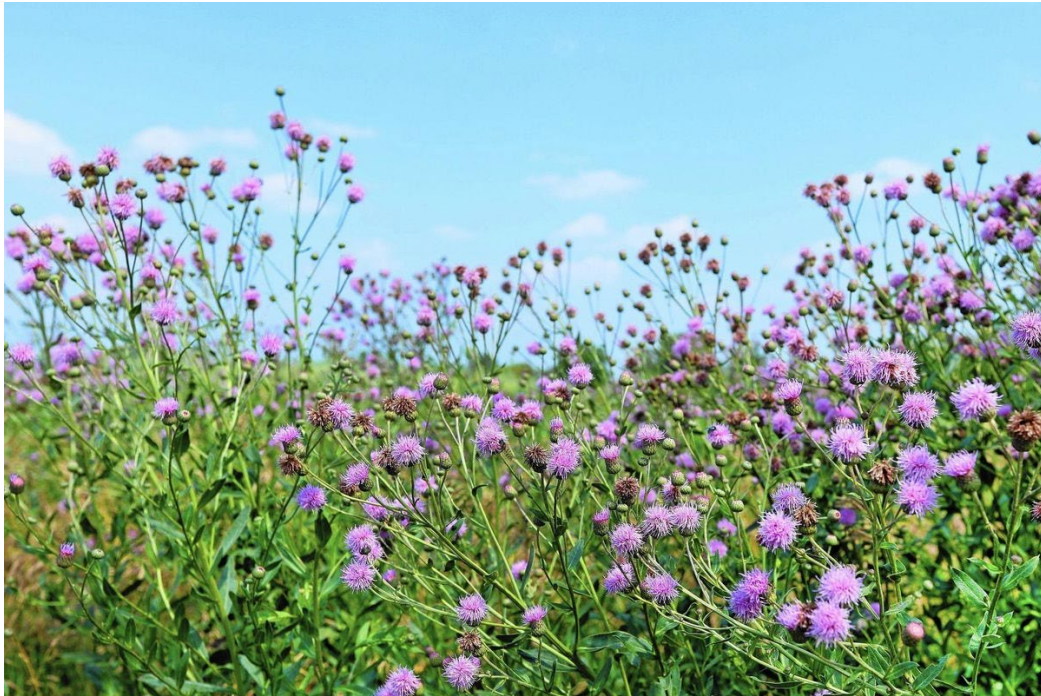
Canada thistle, a noxious weed

Bear in mind that some weed species such as Canada Thistle spreads readily via root propagation. Seed head clipping in this instance will not address the problem, and more active measures such as herbicide will be necessary.