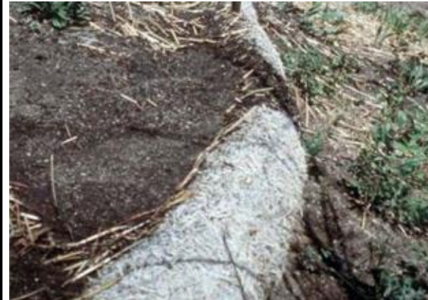
Wattles on a hillslope

The Natural Resources Conservation Service is available to answer your erosion control questions. Call 970.295.5655.