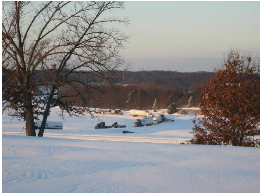
Truck traffic stopped on ramp at the Interstate 24 and Purchase Parkway interchange in western KY.