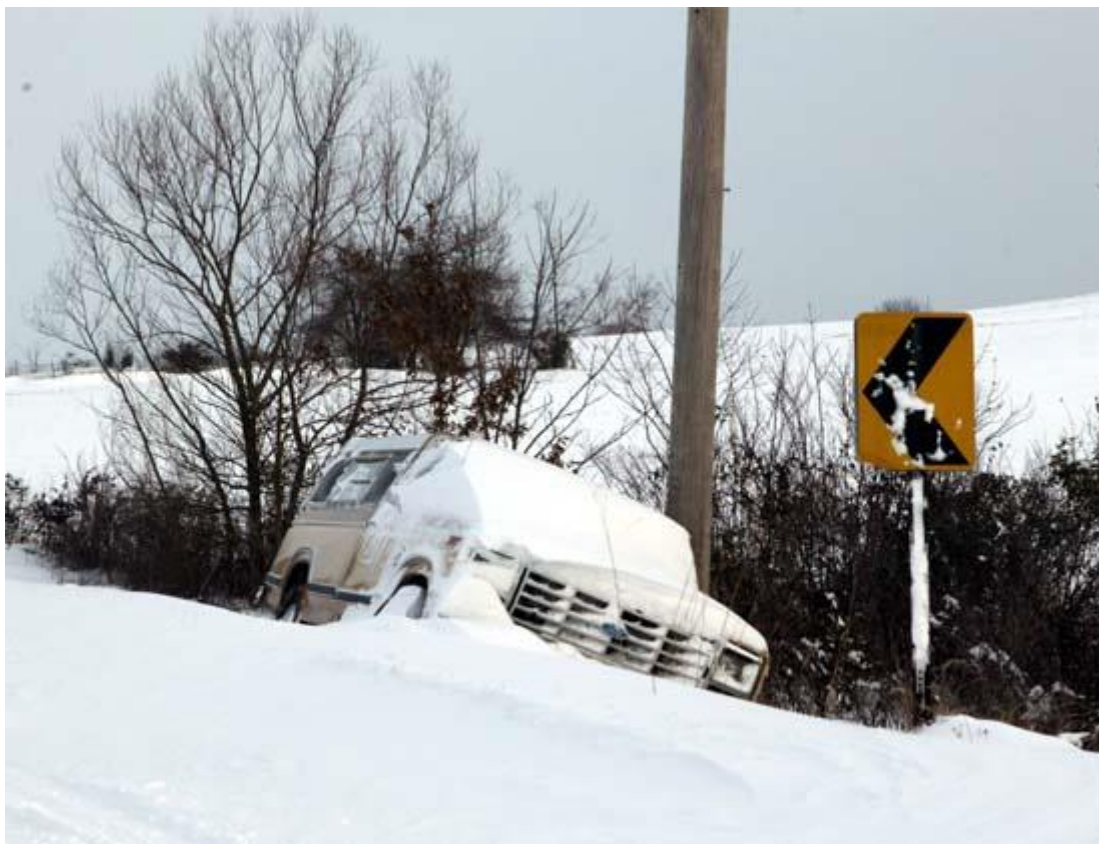
One of many vehicles that were abandoned in ditches. Photo taken in Massac County, IL, courtesy of Beau Dodson.