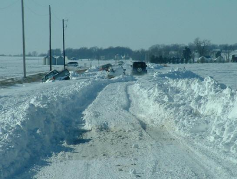
Photo of State Route 168 about two miles west of Fort Branch, IN, where 20 inches of snow fell. Drifts were up to 5 feet.