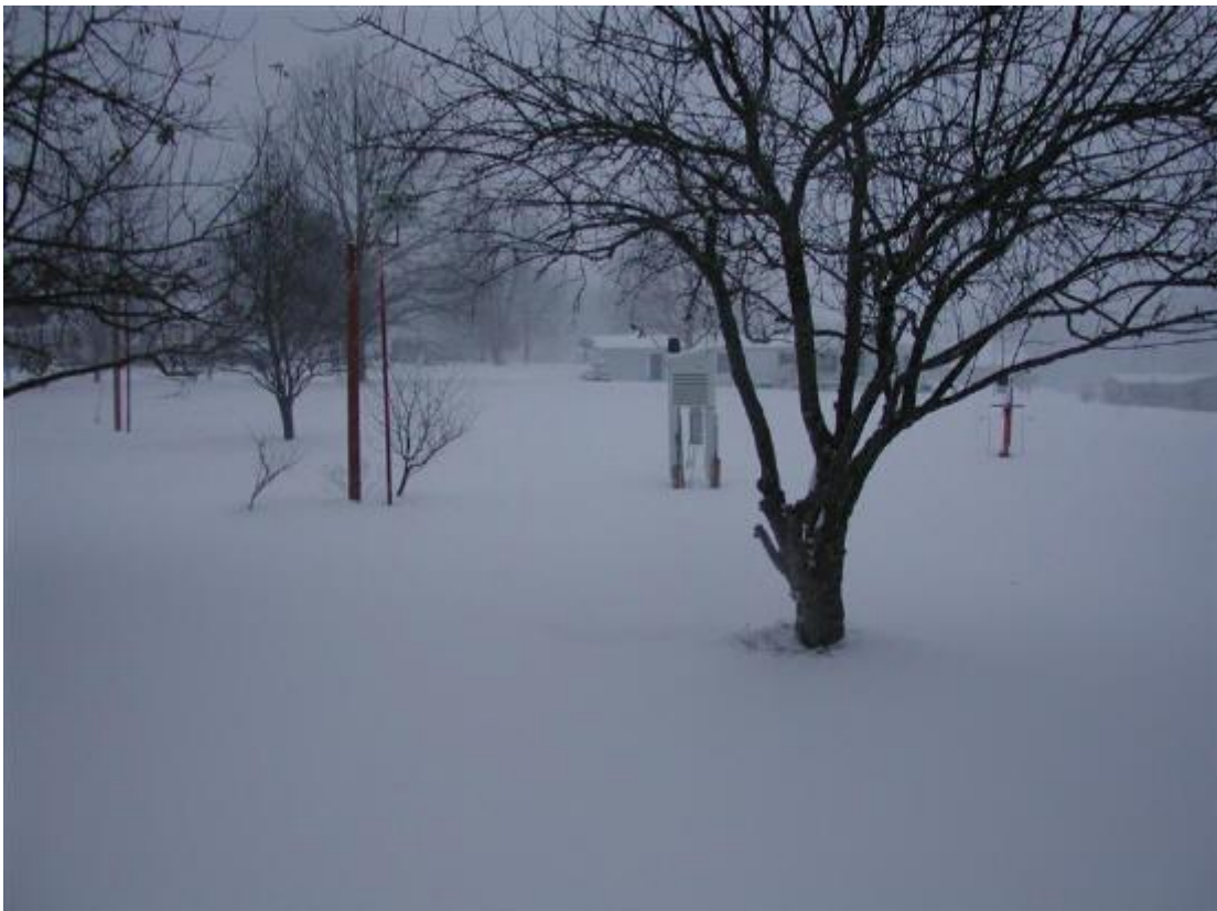
Heavy snow scene in Grayville, IL.