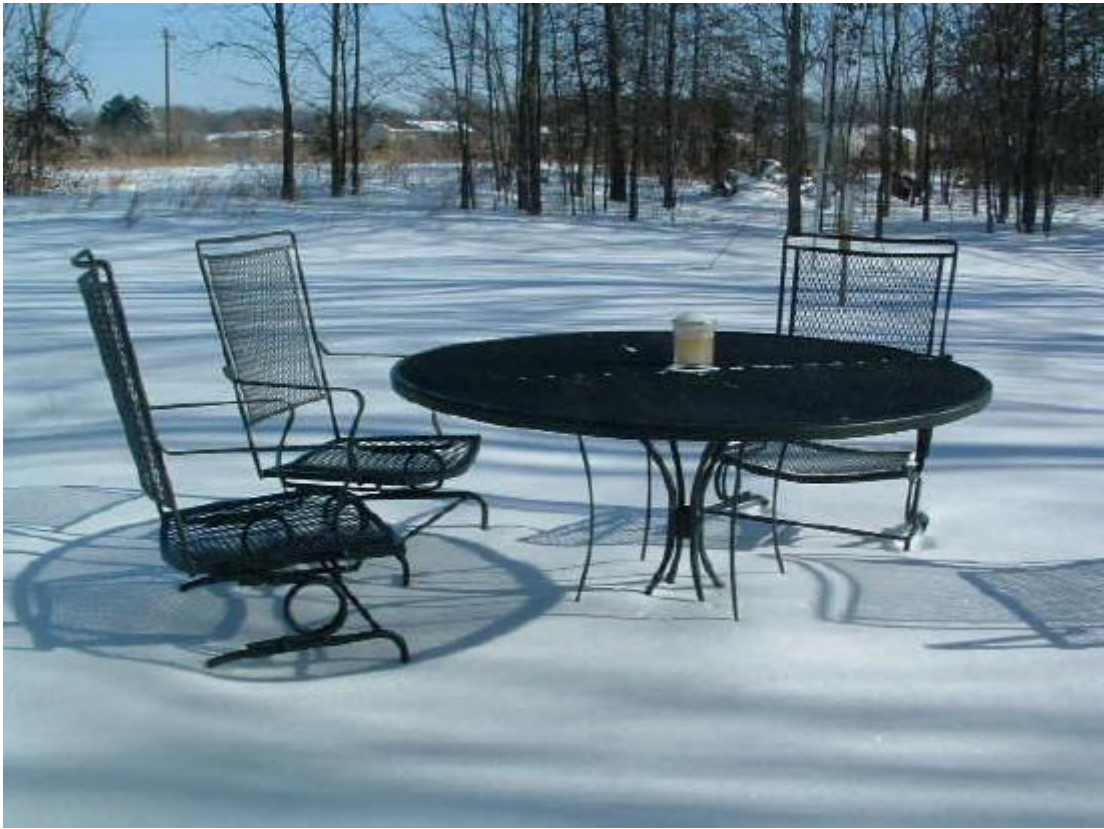
Back yard photo taken near Paducah, KY.