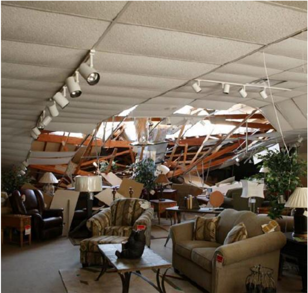
Collapsed section of roof of a furniture store in Paducah, caused by the heavy snow.