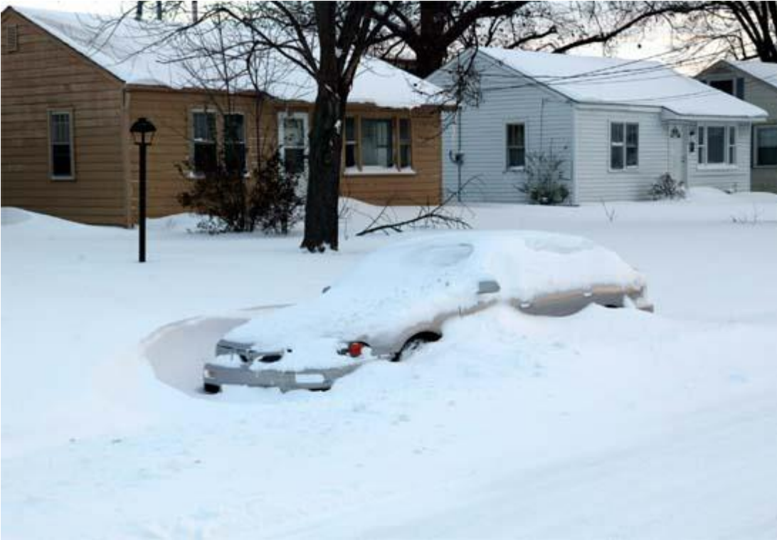
Car buried in a snowdrift in Paducah, KY.