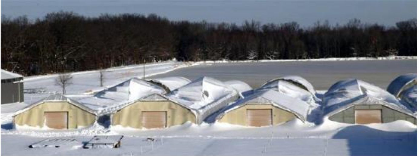
Collapsed greenhouses just off Interstate 24 in Paducah.