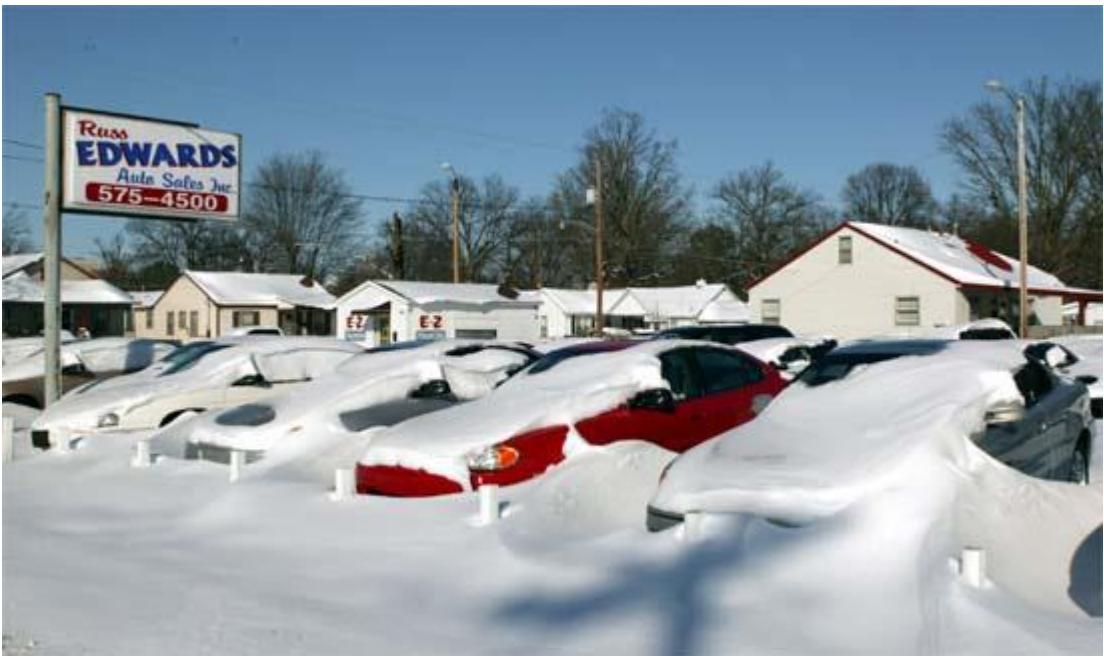
Car lot in Paducah, KY