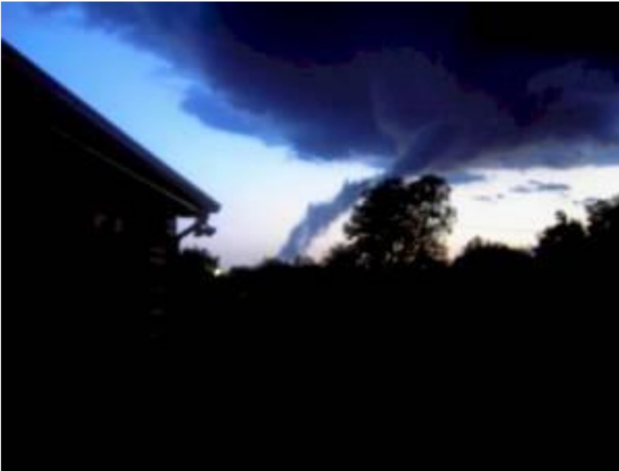
PHOTO OF TORNADO TAKEN ABOUT 4 MILES EAST OF HANSON, KY NEAR MADISONVILLE.

In addition to the tornadoes on May 30, widespread straight-line winds around 60 MPH buffeted large parts of southeast Missouri, western Kentucky, southern Illinois, and southwest Indiana. There were reports of large hail, especially across southeast Missouri. Following is a list of all the reports: