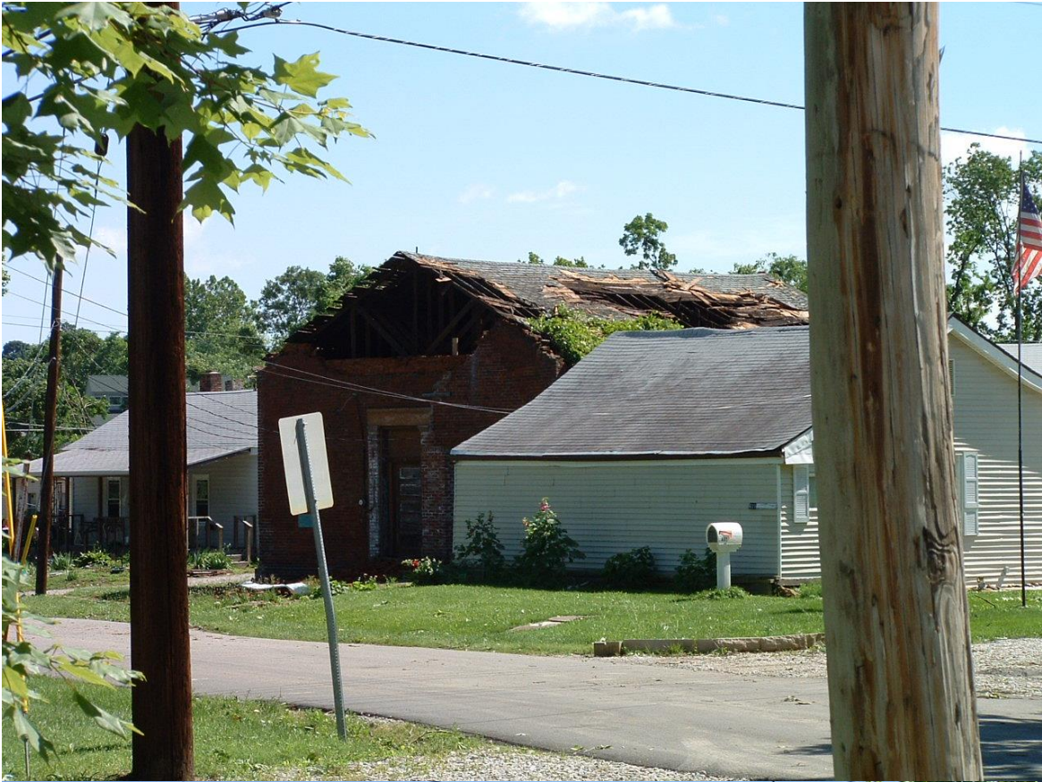
BELOW ARE PHOTOS COURTESY OF SHAWN WEBER OF TORNADO DAMAGE IN NEWBURGH.