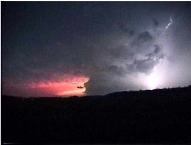
Looking west toward the tornadic storm moving across McCracken County

A BRIEF F0 TORNADO TOUCHDOWN WAS REPORTED EAST OF THE SMALL TOWN OF GAGE KENTUCKY...JUST INSIDE THE MCCRACKEN COUNTY LINE NEAR HIGHWAY 286. THIS SUPERCELL STORM ACTUALLY FORMED IN STODDARD COUNTY MISSOURI...CROSSED THE MISSISSIPPI RIVER AND SPAWNED THIS BRIEF F0 TORNADO IN MCCRACKEN COUNTY. THIS SUPERCELL STORM THEN MOVED EAST AND EVENTUALLY PRODUCE THE F3 TORNADO IN CHRISTIAN COUNTY, KY. THE FOLLOWING PICTURES WERE TAKEN AS THE STORM CONTINUED TO MOVE ACROSS MCCRACKEN COUNTY.