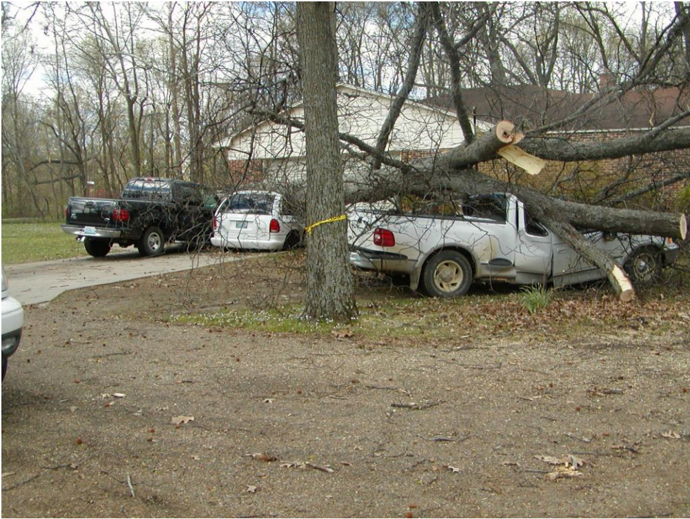
Tree on three vehicles in Dexter, MO