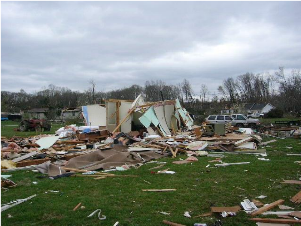
Destroyed home on Princeton Road