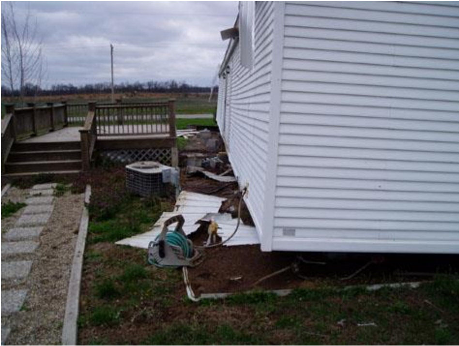
Mobile home moved off its foundation one half mile north of the Fairfield Airport