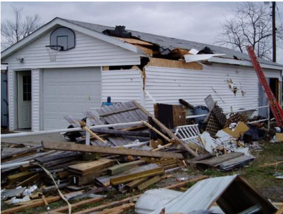
Damage to a house near the Fairfield Airport