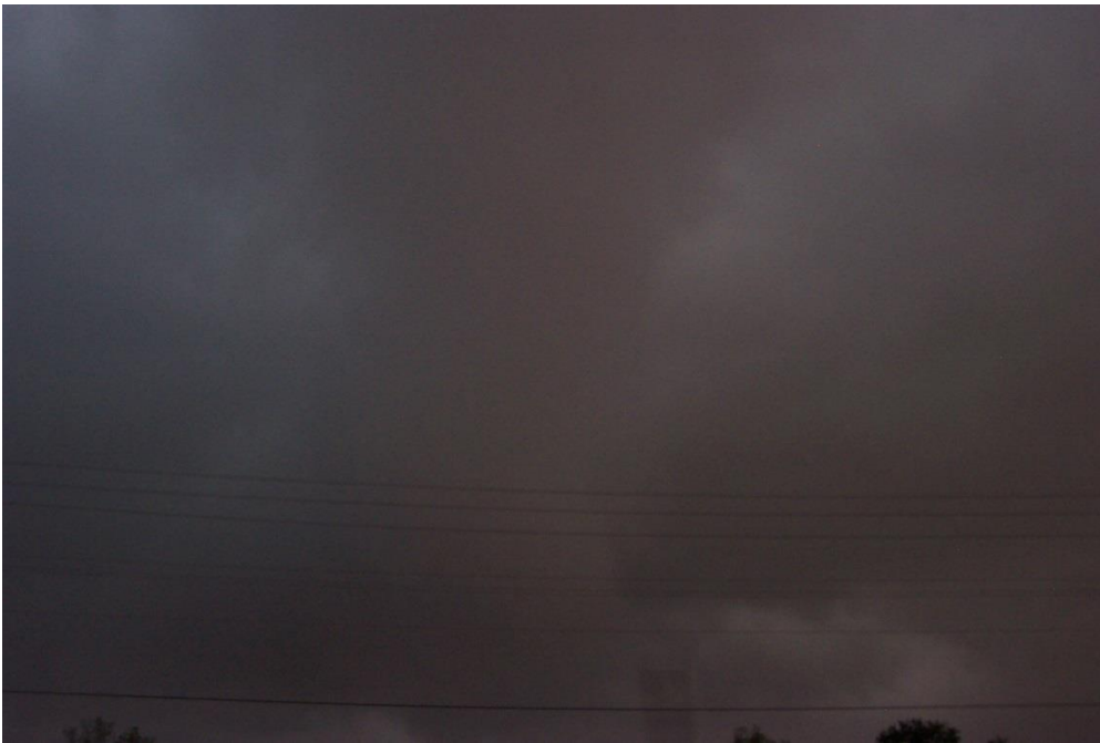
Photo of large hail in Jackson, MO

Picture of a possible funnel cloud or tornado on the west city limits of Lilbourn, MO on State Route D