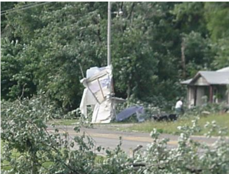
Above: Damage in southeast Mount Vernon