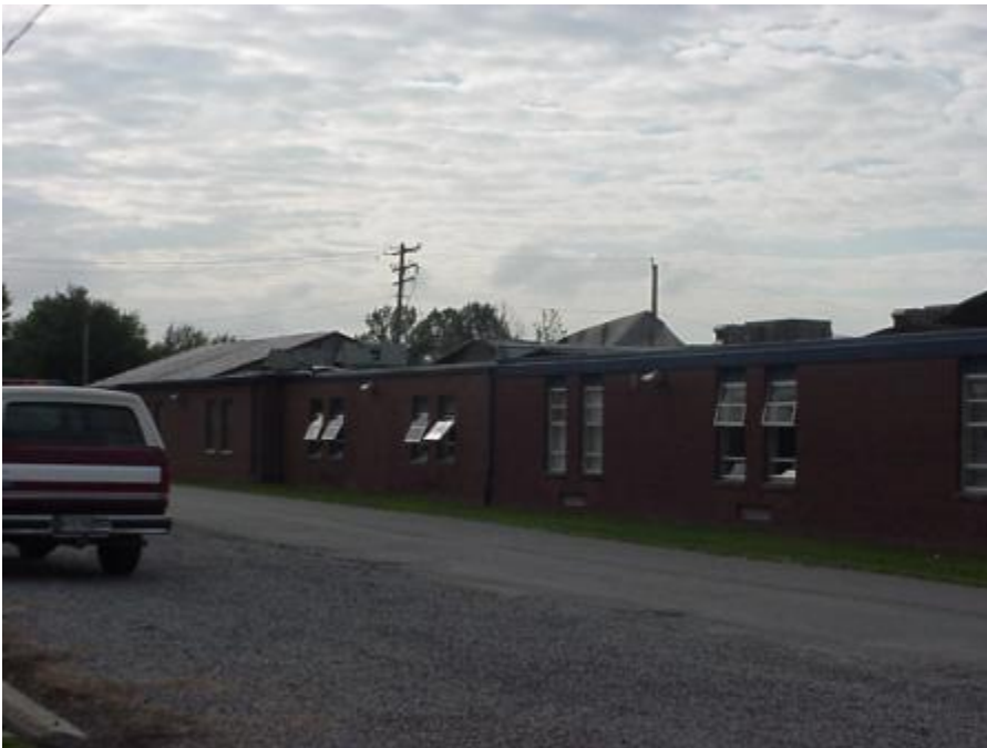
Above: Photo of damaged grade school in Woodlawn, which is several miles west of Mount Vernon near I-64

* DISCUSSION/DAMAGE: SEVERAL HUNDRED HOMES WITH CONSIDERABLE ROOF DAMAGE DUE TO WIND DAMAGE AND FALLEN TREES. MANY LARGE LIMBS AND SOME TREES FALLEN ON HOUSES. SEVERAL THOUSAND TREES DOWN THROUGHOUT THE COUNTY. CONSIDERABLE CROP DAMAGE...ESPECIALLY NEAR MOUNT VERNON. TRACTOR TRAILERS OVERTURNED ON THE INTERSTATE.