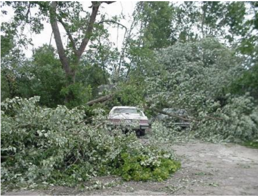
Above: Tree damage was extensive in Mount Vernon