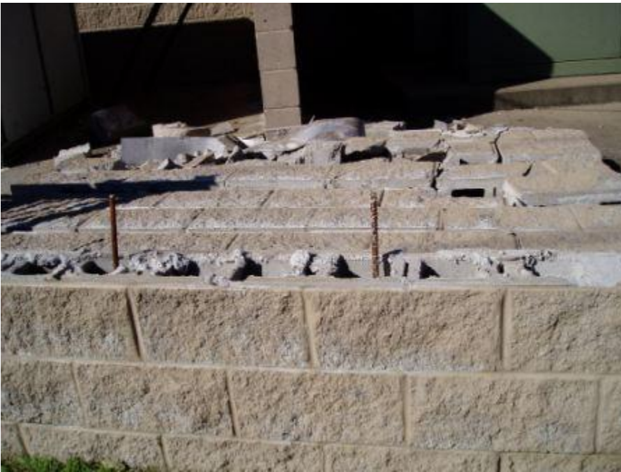
An older building with a garage wall that was blown out...