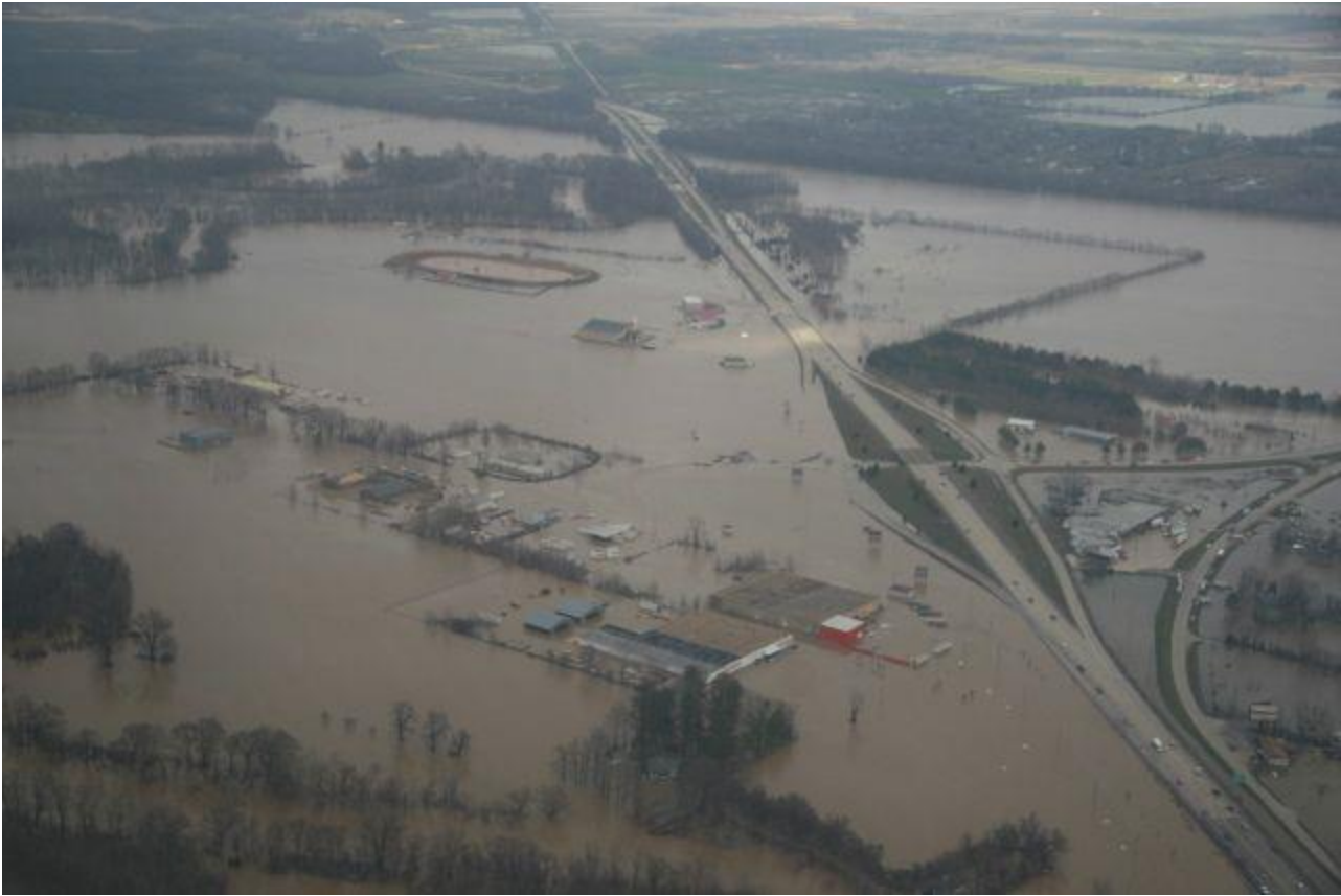
Flooding in Butler County, Missouri