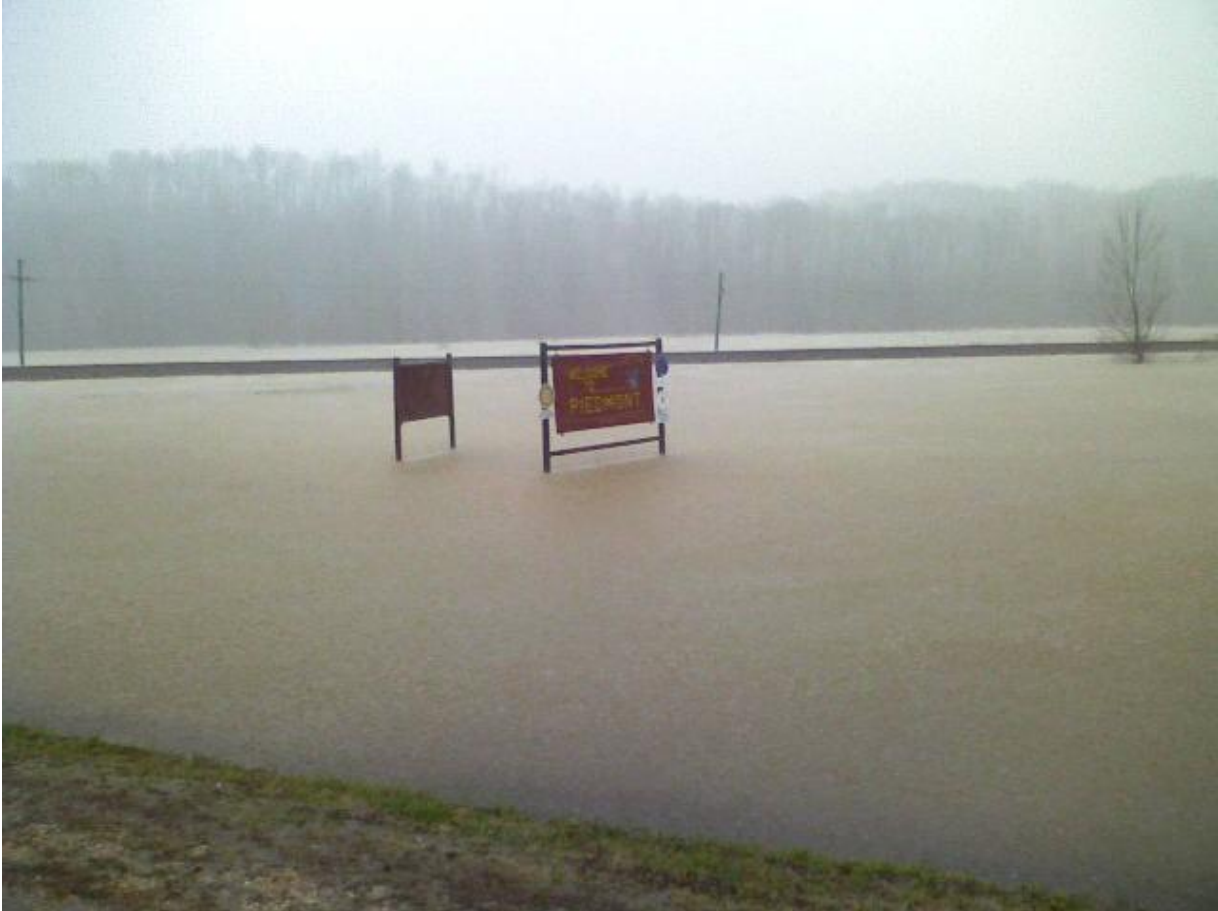
Piedmont, Missouri area