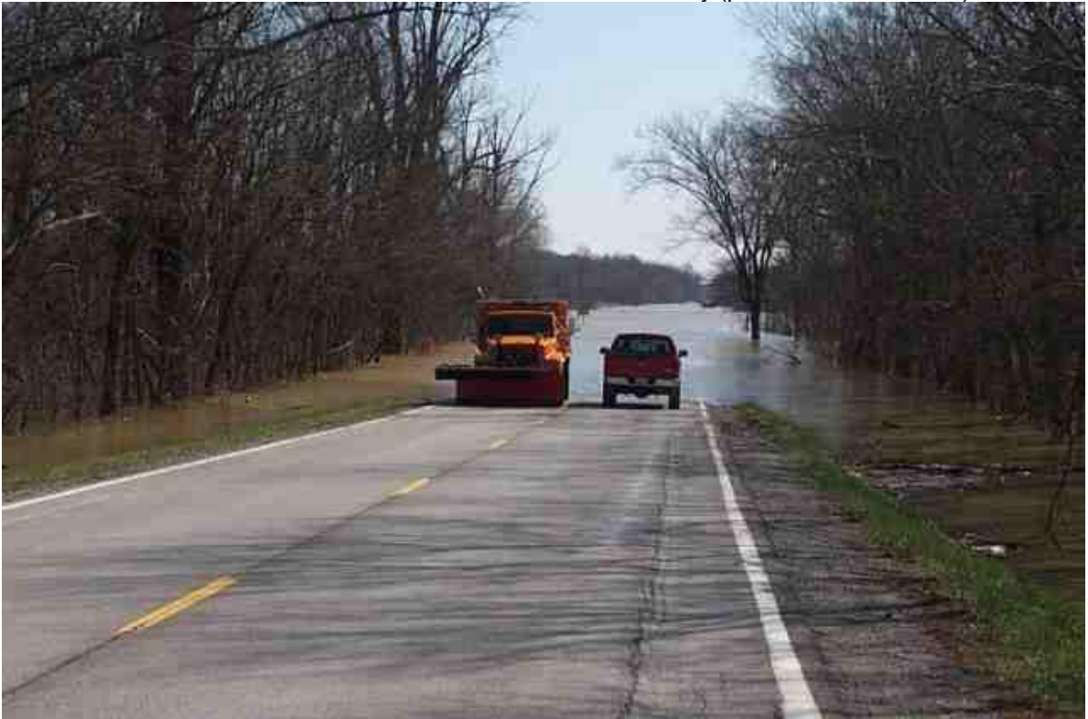
Closer view of the Cache River flooding over Illinois Route 37 in Johnson County (taken March 20)