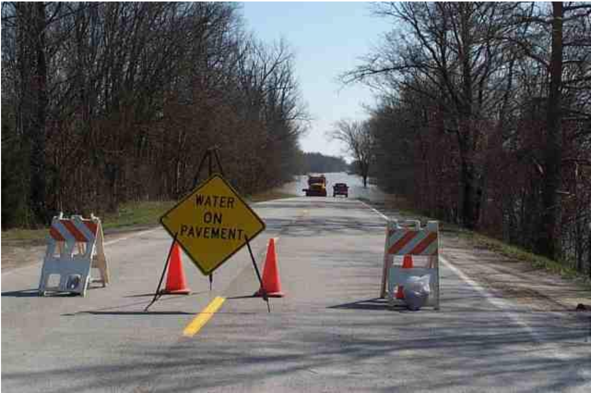
The Cache River flooded over Illinois Route 37 in Johnson County (photo taken March 20)