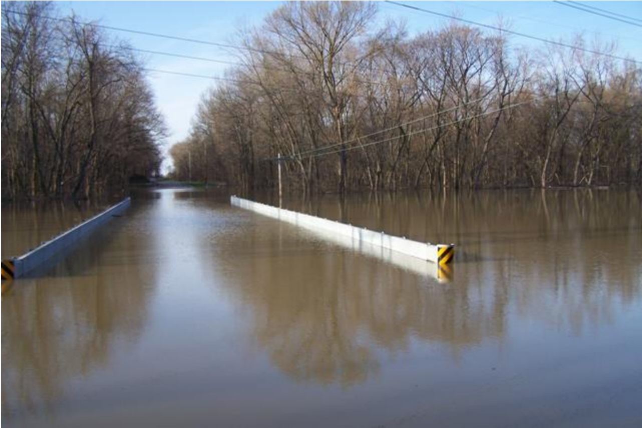
Hurricane Creek near the Big Muddy River on North Bend Road. About 5 miles NW of Carterville ,IL. - Ken Curry