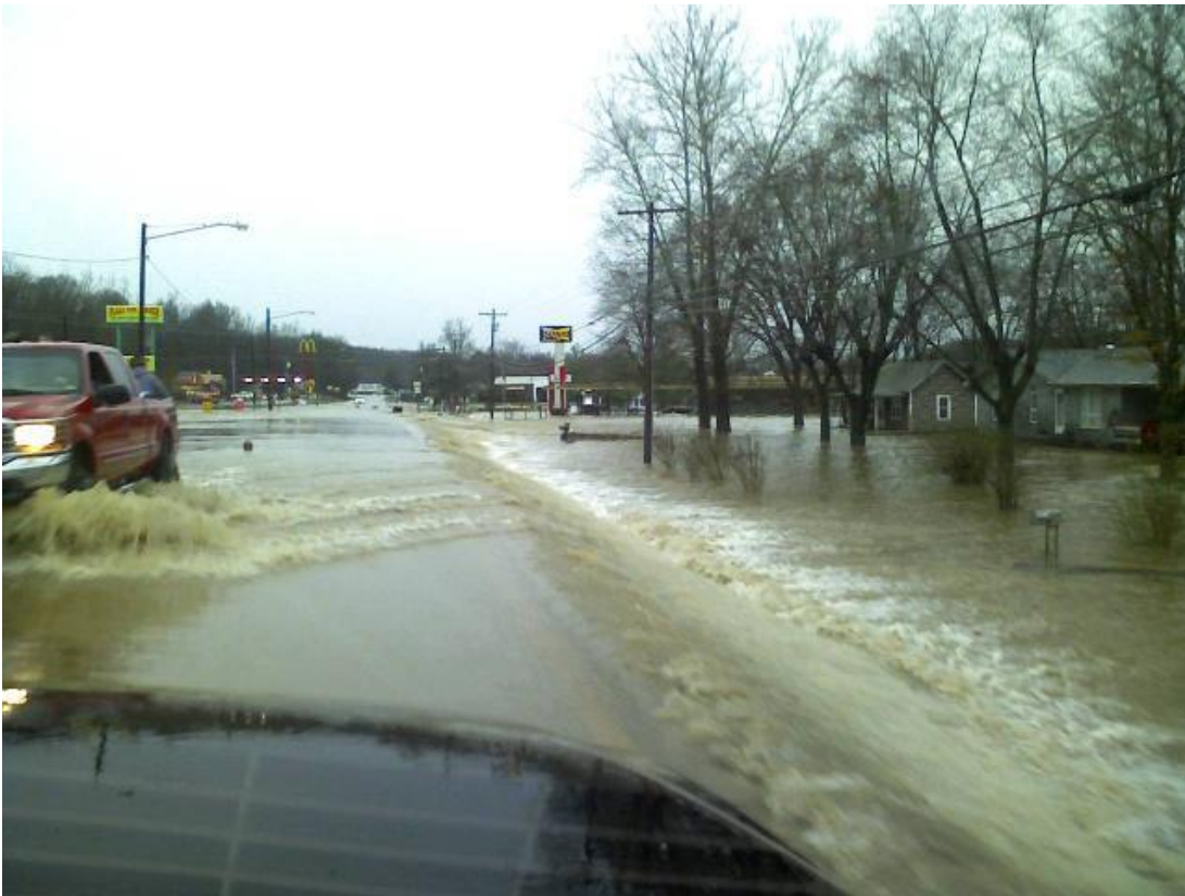
Piedmont, Missouri area