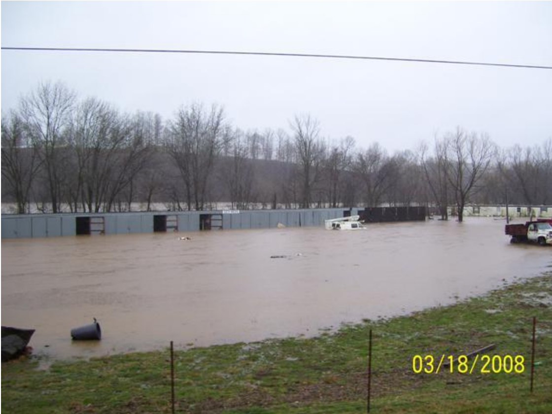
Piedmont, Missouri area