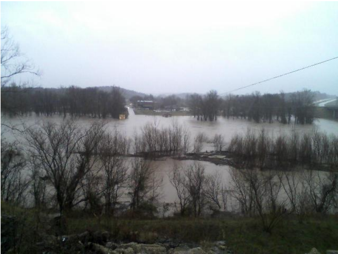
Current River near Van Buren, Missouri