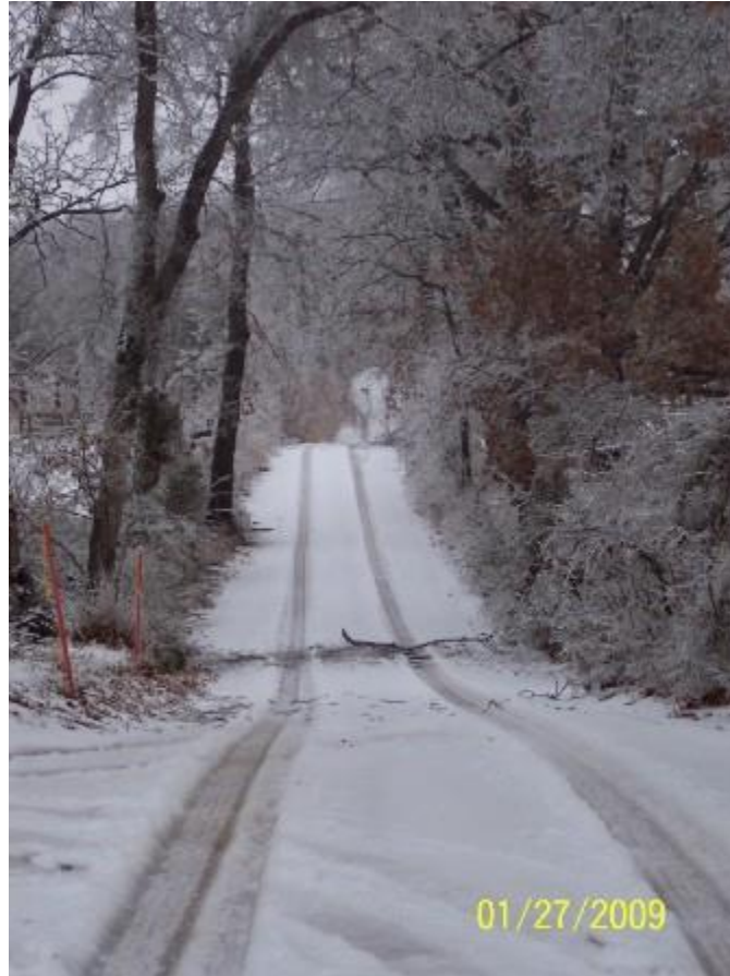
Photo below taken at the beginning of the ice storm on Tuesday morning