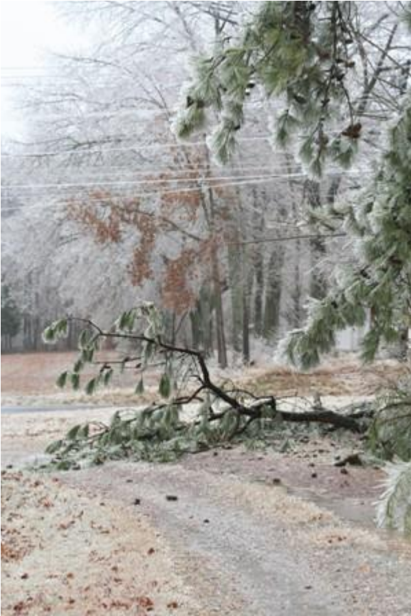
Photo below taken during the middle of the ice storm on Tuesday afternoon (near Paducah, KY)