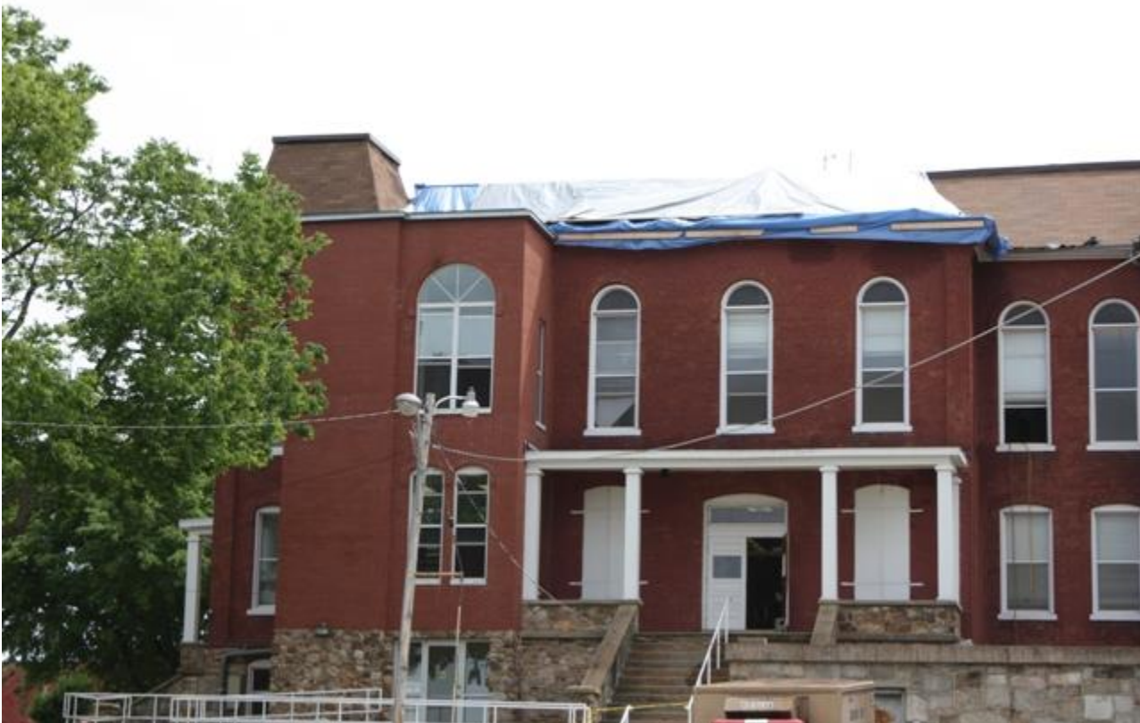
Photo of the damaged courthouse in Doniphan. Flooding rain after the windstorm caused water damage in the courthouse.