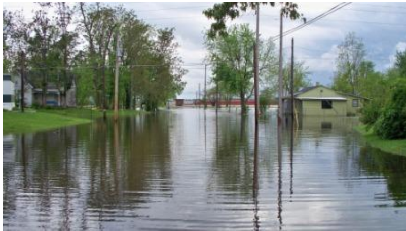
Photo of Ohio River flooding in Metropolis, Illinois on April 27. Barges can be seen in the distant background.

The following hydrograph is NOT CURRENT . It is the archived graph showing the effect of the activation of the New Madrid floodway on Cairo, IL.