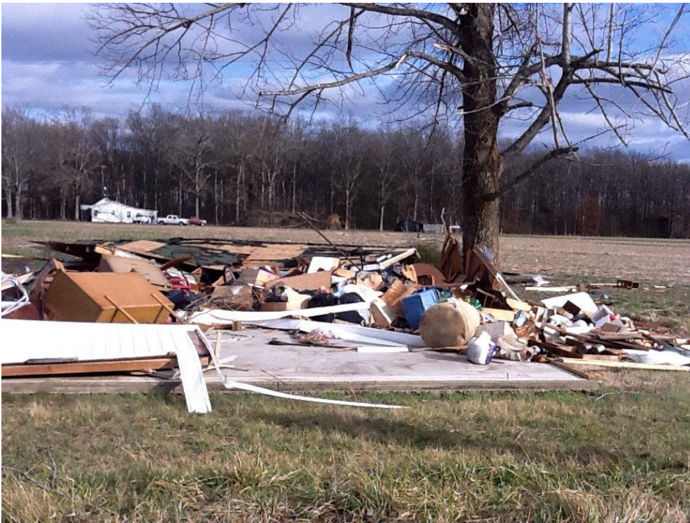
Demolished garage on New Providence Road