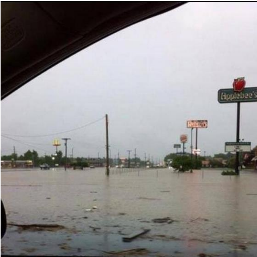
Photo 2: Photo of a flooded hotel near exit 4 off Interstate 24. Evacuations were conducted at a couple of hotels near Perkins Creek.

Photo 1: Taken along U.S. Highway 60 near Interstate 24 in Paducah. Flash flooding of Perkins Creek affected the hotels and restaurants near exit 4 of the interstate.