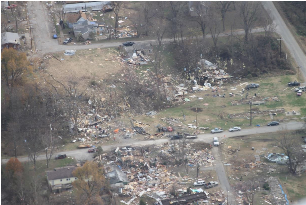
Damage in Brookport, IL from Brookport Tornado.